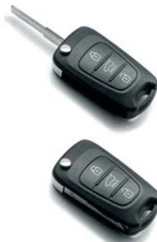
Remote central door and tailgate locking with fold-away key.

To create a luxurious feel, premium materials are used throughout the Venga range. Two durable full cloth materials are available, either Black 'Madrid' cloth or Black 'Beat' cloth (model dependent). In addition, the range-topping Venga '3' and '3 Sat Nav' models are available in a Black 'Bamboo' part cloth and leather upholstery.