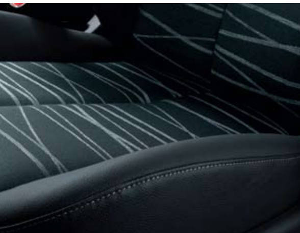
Black 'Bamboo' part cloth and leather upholstery (Venga '3' and '3 Sat Nav' models).