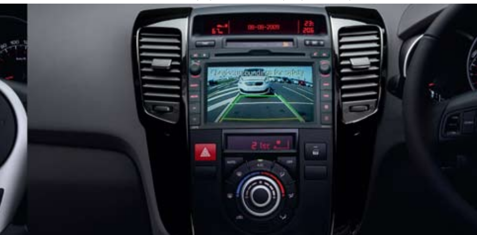
Advanced reversing camera system (Venga '3 Sat Nav').