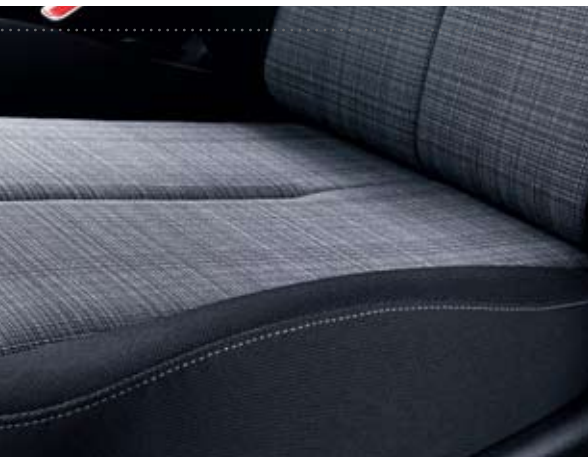
Black 'Madrid' cloth (Venga '1' and '1 Air').