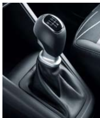
Leather gearshift (Venga '2' upwards)

Clever interior design makes a Venga a very comfortable place to be.