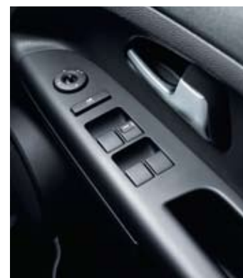
Front electric windows with automatic up/down function