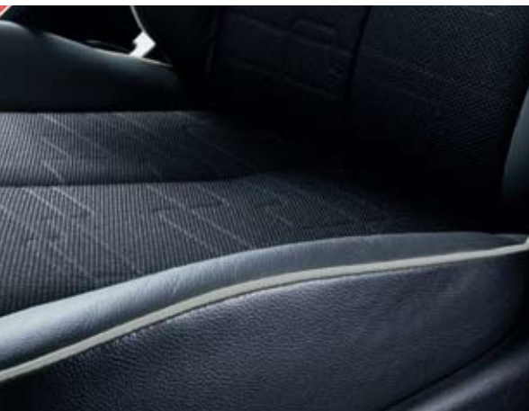
Black 'Beat' cloth (Venga '2').