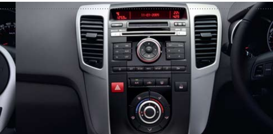
Silver painted metallic centre fascia (Venga '1' and '2' models).