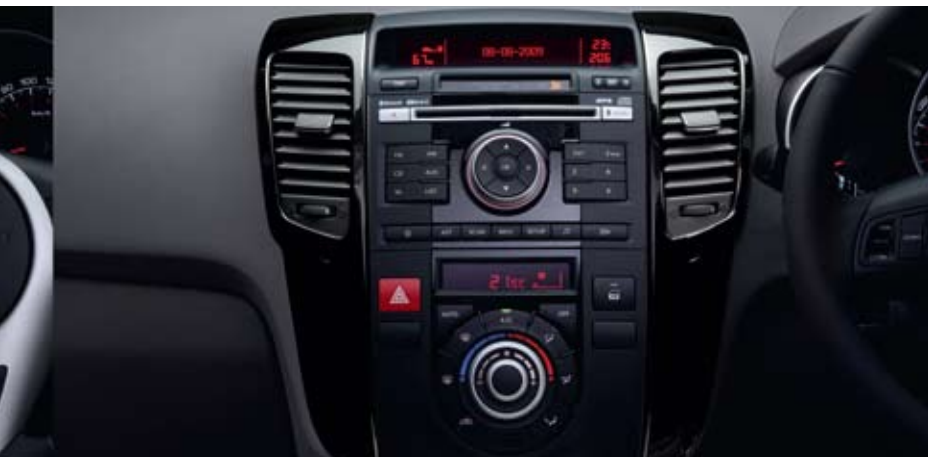
Black high-gloss centre fascia (Venga '3' models).