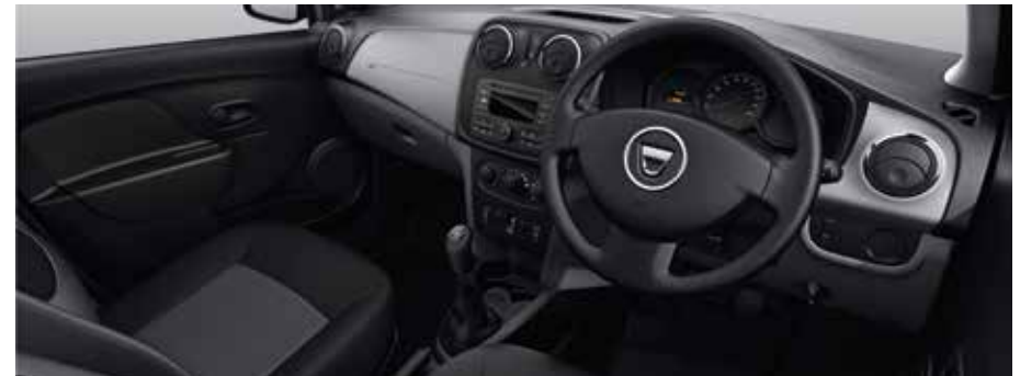
Two tone 'Atom' cloth upholstery