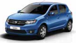
Sargasso Blue (RPK)