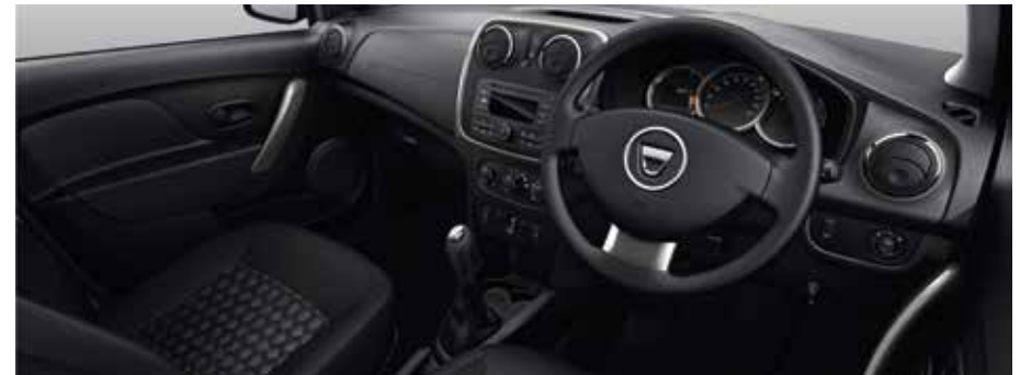
Dark carbon 'Quantum' cloth upholstery