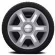
15" 'Colorado' wheel trims