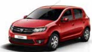
Cinder Red (B76)