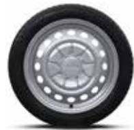
15" 'Gobi' steel wheels