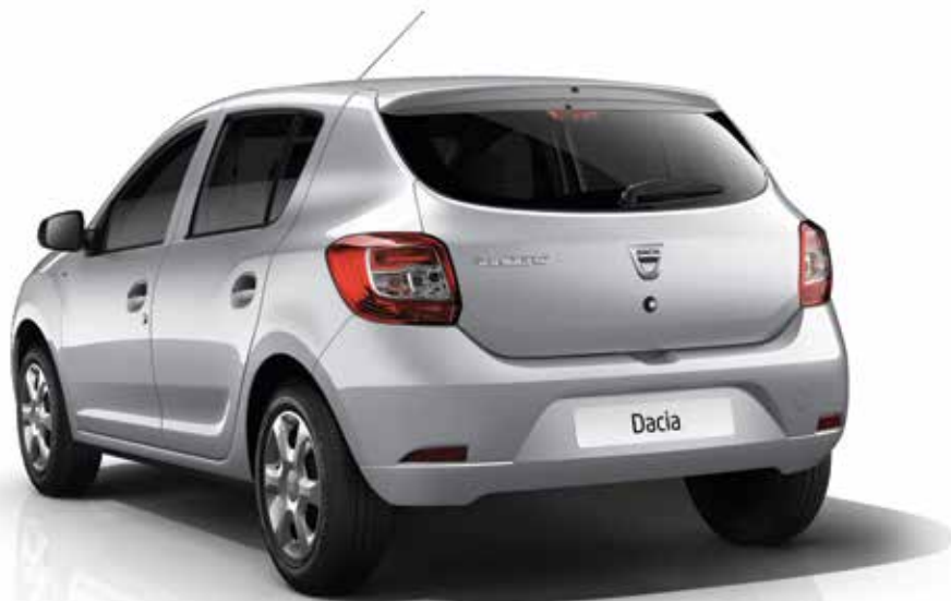
Model shown is a Dacia Sandero Ambiance with optional Mercury metallic paint.

* From first date of registration. Warranty expires on the first of the two limits reached.