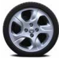
15" 'Sahara' alloy wheels