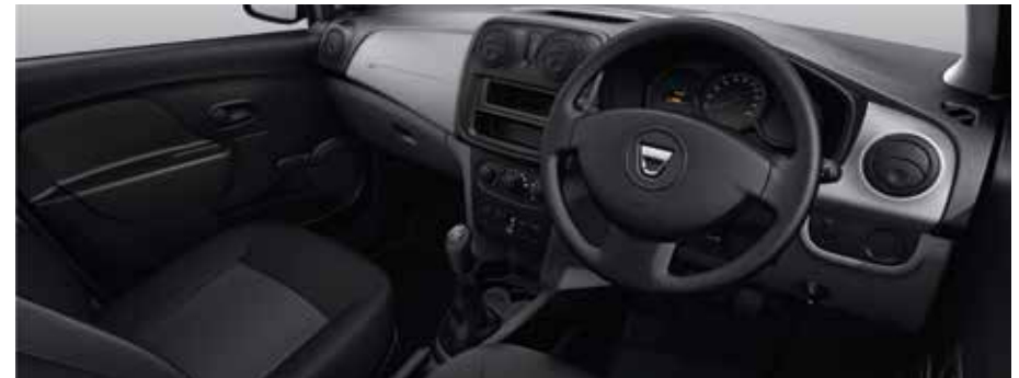
Black 'Element' cloth upholstery