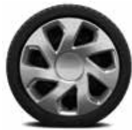
15" 'Kalahari' wheel trims