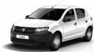
Glacier White (369)