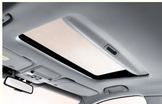
Electric sunroof with sunshade