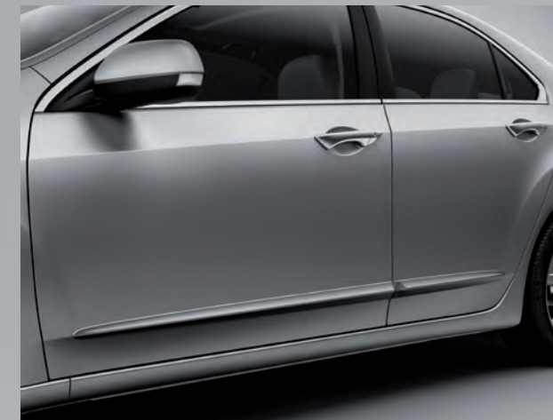
> Premium Pack