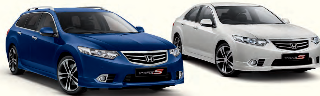
Models shown are Tourer and Saloon 2.2 i-DTEC Type S