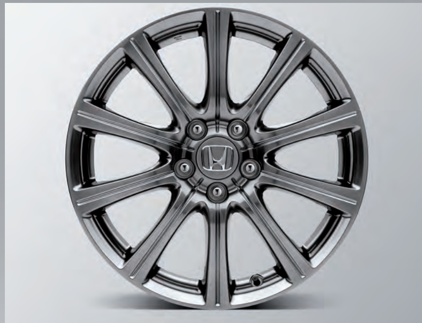
> 18" Sigma alloy wheel