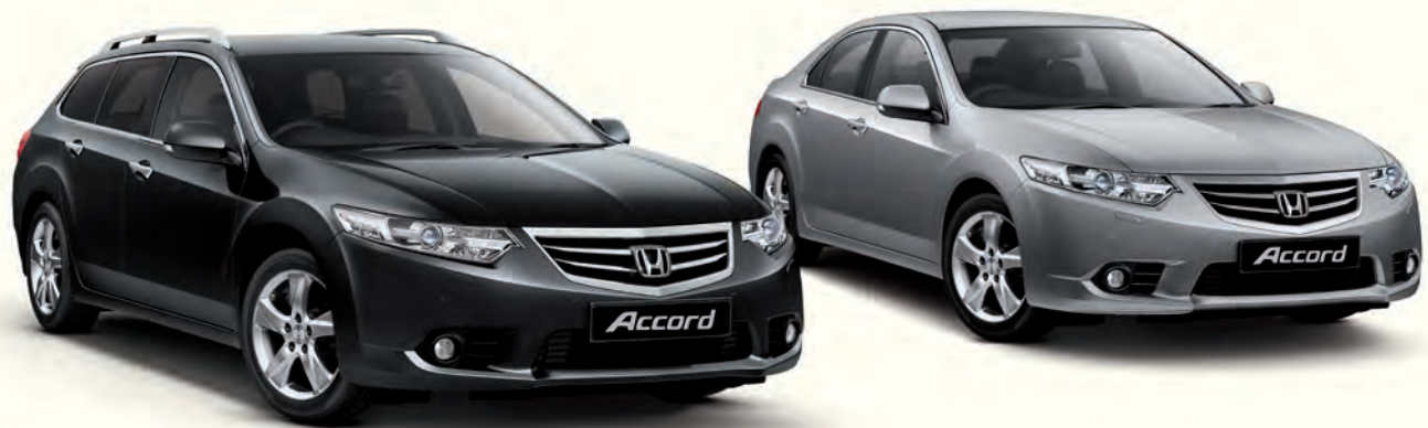
Models shown are Tourer and Saloon 2.0 i-VTEC EX with ADAS