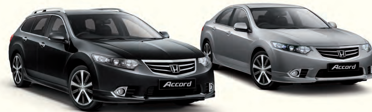
Models shown are Tourer and Saloon 2.0 i-VTEC ES-GT

Advanced Navigation pack includes: Voice recognition DVD Satellite Navigation, GPS dual climate control, rear parking camera, Premium Audio system with 6 CD changer and subwoofer