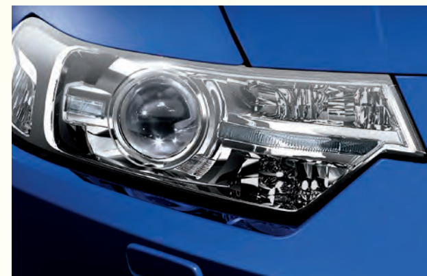
Bi-HID with Active Cornering Lights (ACL)