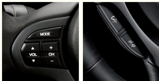
> Audio controls