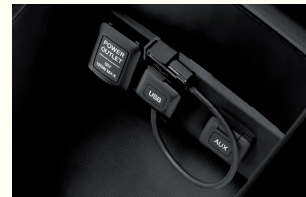
> USB connector and Auxiliary sockets