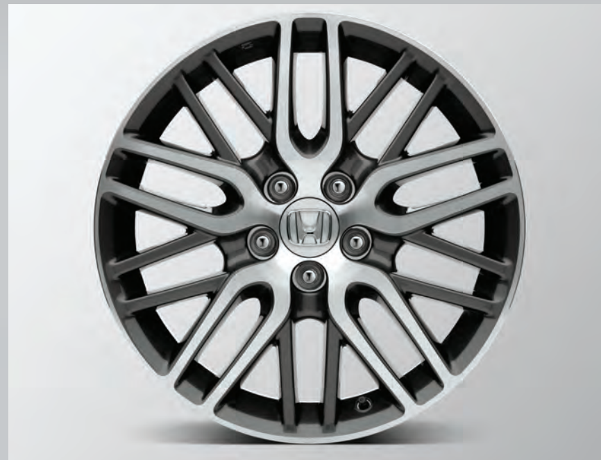
> 18" Delta alloy wheel