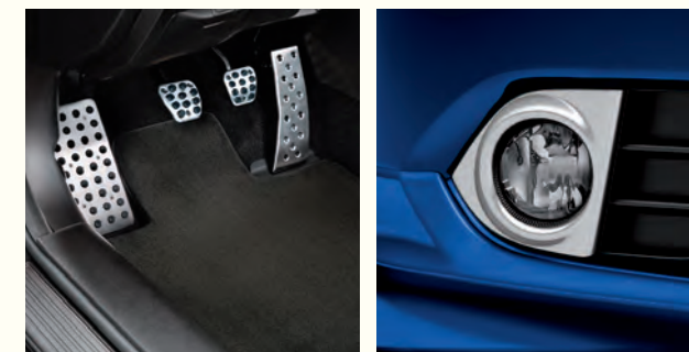
> Sports pedals