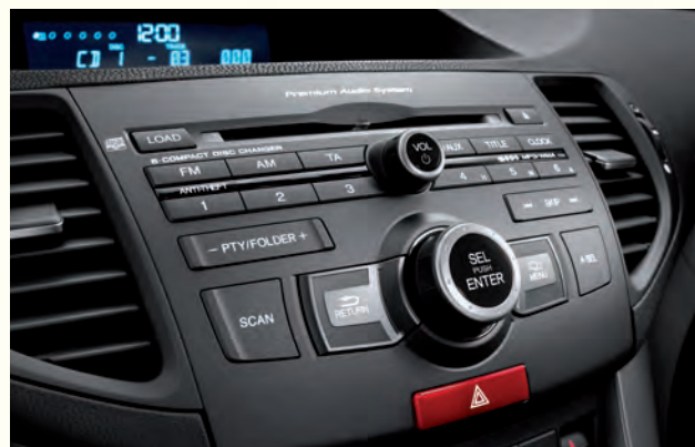
> Stereo CD with RDS and MP3