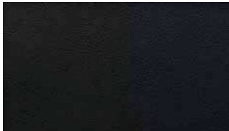
Black Leather (from 'KX-2')