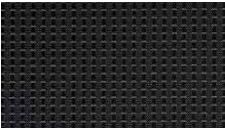
Black Cloth ('KX-1')