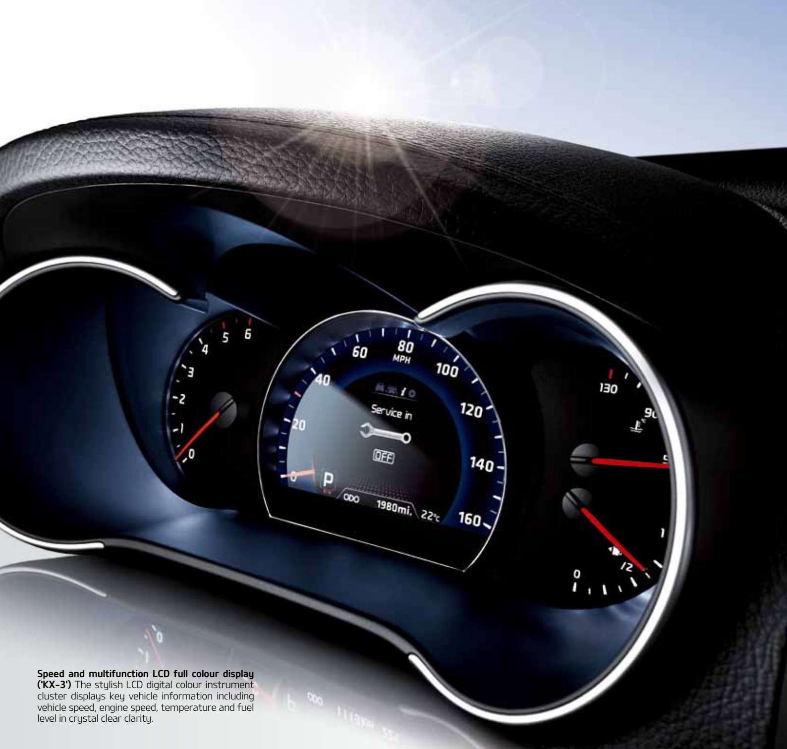
Speed and multifunction LCD full colour display ('KX-3') The stylish LCD digital colour instrument cluster displays key vehicle information including vehicle speed, engine speed, temperature and fuel level in crystal clear clarity.