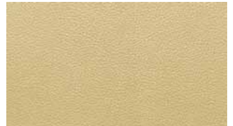
Cream leather ('KX-3') exterior colour dependent

Some parts of the leather upholstery contain faux leather.