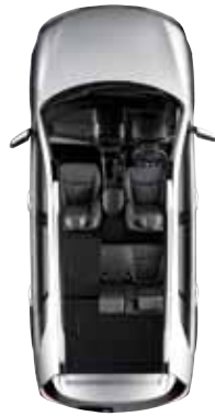
Partial 2 nd & 3 rd row folding