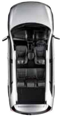
3 rd row folding