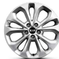
18" alloy wheel

For detailed information about tyre labelling on the new Sorento range log onto www.kia.co.uk