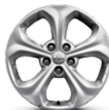
17" alloy wheel