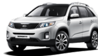
Snow Pearl White