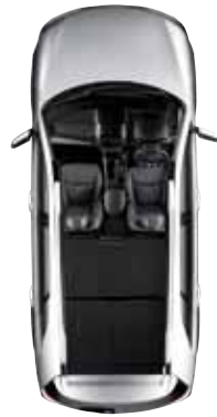
2 nd & 3 rd row folding