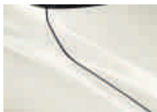
Arctic White Solid (A4D)