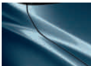
Blue Reflex Mica* (42B)