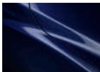
Stormy Blue Mica* (35J)