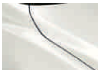
Snowflake White Pearlescent* (25D)