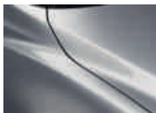
Aluminium Metallic* (38P)