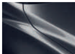
Meteor Grey Mica* (42A)