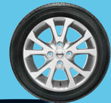
Ask for the Pixo accessories brochure