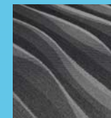
Black and Grey Trim