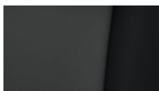
JET BLACK JET BLACK CLOTH