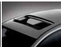
Electric Sunroof (Rio '4')