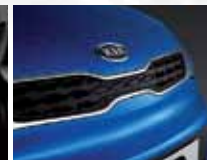
Tiger-nose grille with black mesh and chrome surround (Rio 'VR7' upwards)