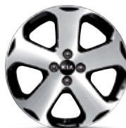
17" alloy wheels

1.4 107bhp 6-speed manual ISG (5 door only) 1.4 CRDi 89bhp 6-speed manual ISG (5 door only)