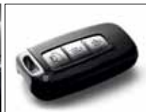
Smart key (Rio '4')