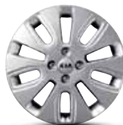
16" alloy wheels

1.25 84bhp 5-speed manual 1.4 107bhp 6-speed manual ISG 1.4 107bhp 4-speed auto* (5 door only) 1.1 CRDi 74bhp 6-speed manual ISG* 1.4 CRDi 89bhp 6-speed manual ISG*