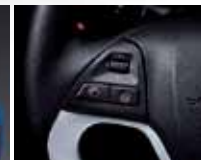
Steering wheel mounted controls