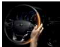
Heated steering wheel (Rio '4')