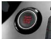
Engine Start/Stop button (Rio '4')