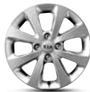
15" alloy wheels

'1' 1.25 84bhp 5-speed manual 1.1 CRDi 74bhp 6-speed manual ISG (5-door only)