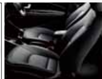
Stylish black leather upholstery* (Rio '4')