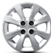
15" steel wheels

'1' 1.25 84bhp 5-speed manual '1' 1.1 CRDi 74bhp 6-speed manual ISG (5-door only) '1 Air' 1.25 84bhp 5-speed manual* '1 Air' 1.1 CRDi 74bhp 6-speed manual ISG*