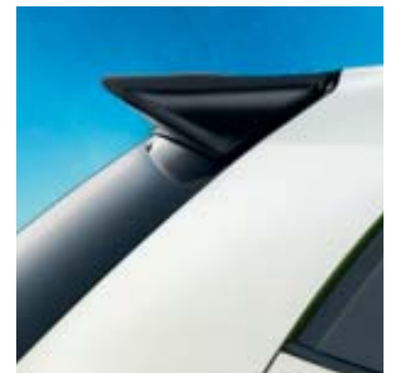
Jet Black rear roof spoiler.