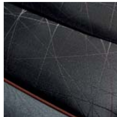
Black cloth seat trim with red piping.

The Mazda2 Colour and Sport Colour Editions, which are limited to 1,000 cars each, feature unique interior numbering, dramatic dark grey alloy wheels, dynamic Jet Black rear roof spoiler with matching Jet Black heated power folding door mirrors further complementing the individuality of these exclusive cars. Available in three distinctive body colours of True Red, Crystal White Pearlescent or Aluminium Silver Metallic, providing a perfect contrast to the sleek black styling, these cars have enhanced poise and eye-catching style on the road. The exclusive features continue within these Limited Editions with body colour-coordinated interior styling cues ensuring the ultimate in contemporary design.