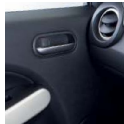
Colour-coordinated interior trim.