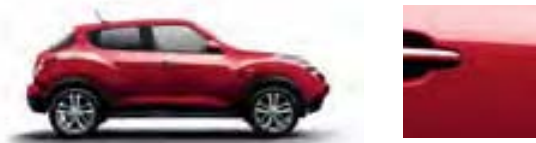
Force Red - metallic - NAH