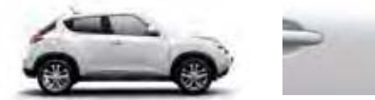
Arctic White - solid - 326