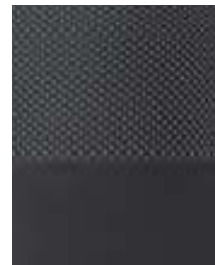
VISIA & ACENTA Grey casual fabric