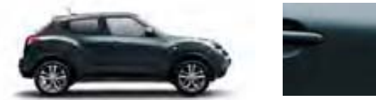
Haptic Blue - metallic - RAQ