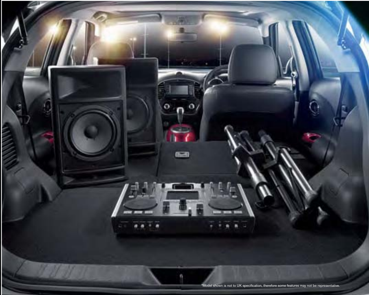
*Model shown is not to UK specification, therefore some features may not be representative.