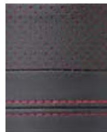
TEKNA Premium leather** + red detailing