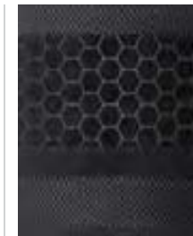
ACENTA PREMIUM & N-TEC Grey premium fabric