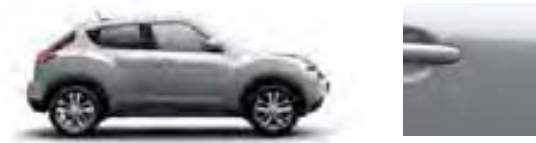
Blade Silver - metallic - KY0