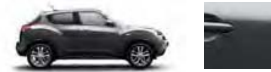
Gun Metallic - metallic - KAD