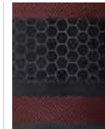
ACENTA PREMIUM & N-TEC Red premium fabric