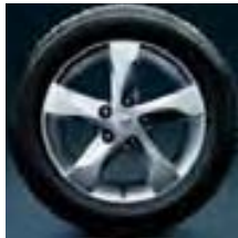
16" alloy wheel