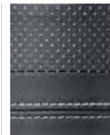
TEKNA Premium leather** + white detailing*

*Available Autumn 2013. Please check with your local dealer for further information. **Some parts of leather seats may contain artificial leather