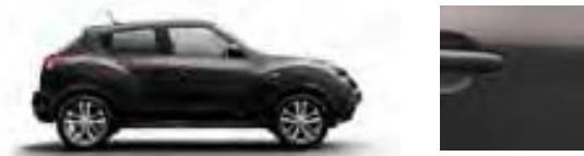
Machine Brown - metallic - KAX