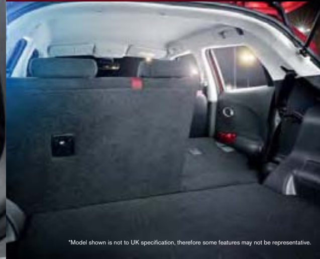
*Model shown is not to UK specification, therefore some features may not be representative.