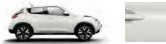
Storm White - metallic - QAB*

*Currently only Available on Juke Nismo. Other grades will be available Autumn 2013. Please check with your local dealer for further information