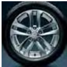
17" Sport alloy wheel