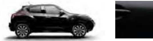
Night Shade - metallic - GAB