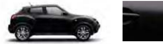
Pearl Black - metallic - Z11