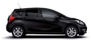
PEARL BLACK - M - Z11