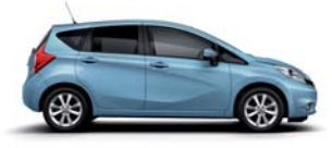
SONIC BLUE - M - RBE