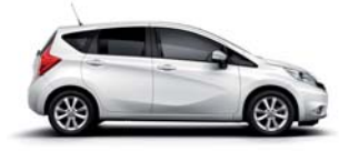
STORM WHITE - M - QAB