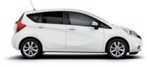
ARCTIC WHITE - S - 326