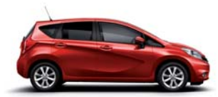
FORCE RED - M - NAH