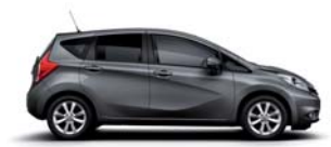
GUN METALLIC - M - KAD