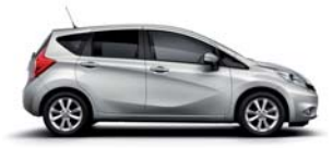
BLADE SILVER - M - KY0