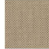
LEATHER WITH PERFORATION - CREAM