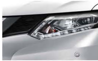
Universal Silver - M