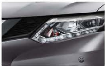
Gun Metallic - M