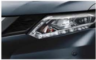
Haptic Blue - M