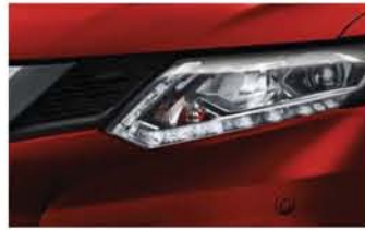
Chilli Pepper - S