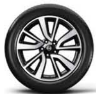
19" alloy (machine cut)