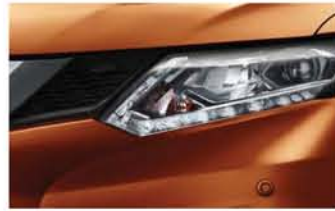
Copper Blaze - M