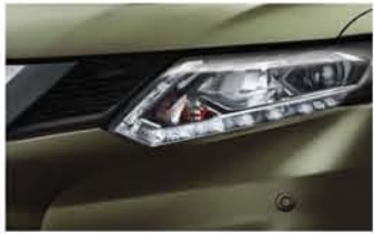
Titanium Olive - M