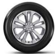
17" alloy (silver painted)