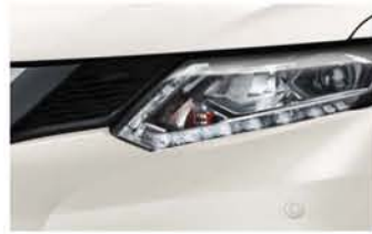
Storm White - P