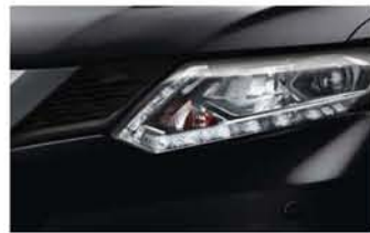
Ebisu Black - M