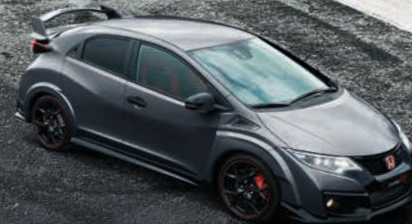
Polished Metal Metallic