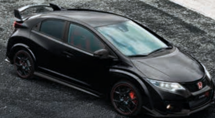
Crystal Black Pearl