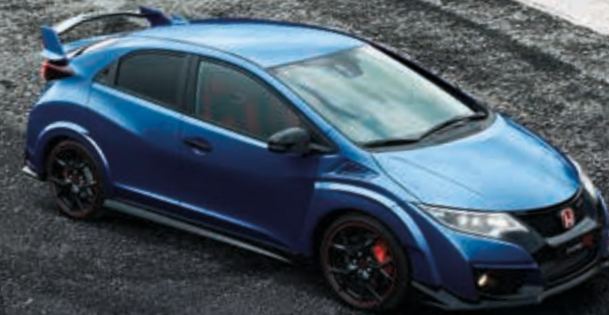
Brilliant Sporty Blue Metallic