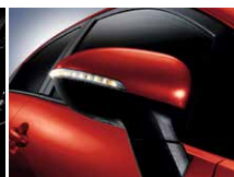
Electrically folding, heated door mirrors with LED indicator lights (Rio '2' upwards)