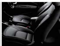
Stylish black leather upholstery* (Rio '4')