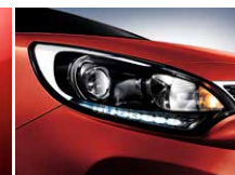
LED daytime running lights (Rio '3' upwards)