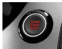
Engine Start/Stop button (Rio '4')