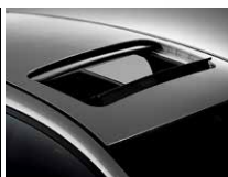
Electric sunroof (Rio '4')