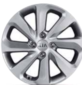
16" alloy wheels