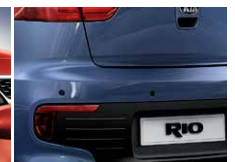
Reversing sensors (Rio 'SR7', '3' and '4' models)