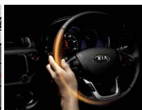
Heated steering wheel (Rio '4')