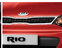
Tiger-nose grille with black mesh and chrome surround (Rio 'SR7' upwards)