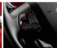
Steering wheel mounted controls