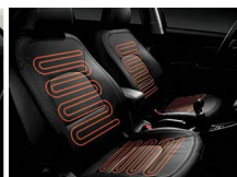
Heated front seats (Rio '3' upwards)