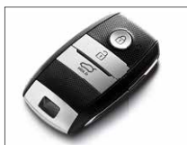
Smart key (Rio '4')