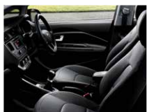
Premium black cloth upholstery (Rio 'SR7', '2' and '3')

From the Rio's distinctive signature 'Tiger-nose' grille, sporty stance and striking side character line, to the muscular rear, every part of the Kia Rio dazzles with exciting, dynamic details.