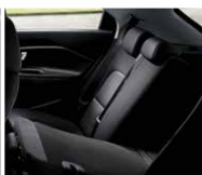
60:40 split folding 2nd row seats