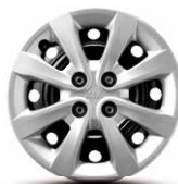
15" steel wheels