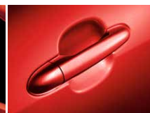
Body coloured bumpers, door handles and mirrors