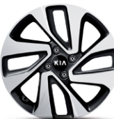
17" alloy wheels