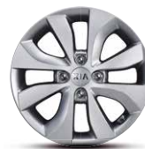
15" alloy wheels