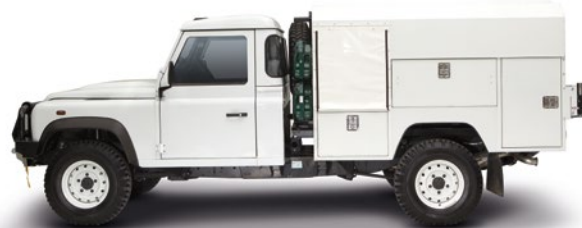
130 Chassis Cab Mobile Maintenance Vehicle