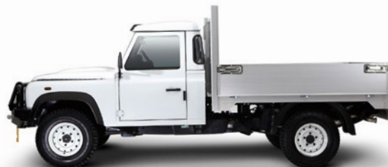
130 Chassis Cab Drop Side / Tipper