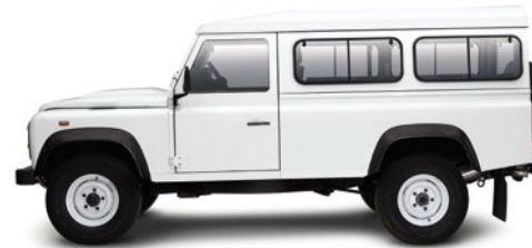
110 Hard Top 10 Seater Personnel Carrier

For commercial or market legislative reasons not all Defender Professional Vehicles are available in all markets. For further information, please contact your Land Rover Dealer or visit www.landrover.com/professional