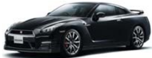
Pearl Black (GAG)