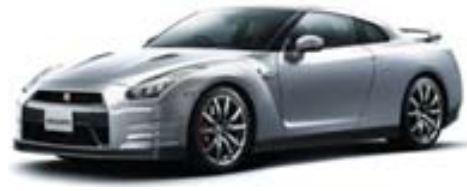
Ultimate Silver (KAB)