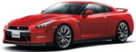
Vibrant Red (A54)