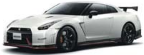
Storm White (QAB)