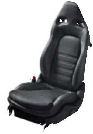
Premium Black Leather*