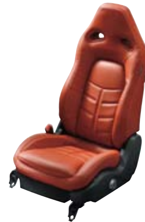
Premium Red Leather*