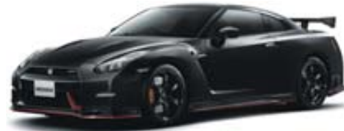
Pearl Black (GAG)