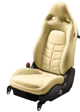
NEW Premium Ivory Leather*

*Some parts of leather trim may contain artificial leather