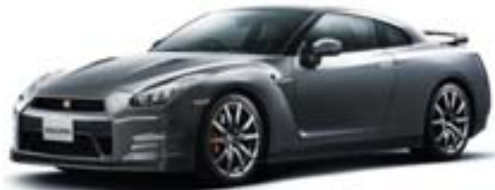
Gun Metallic (KAD)