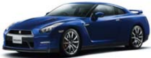
Daytona Blue (RAY)