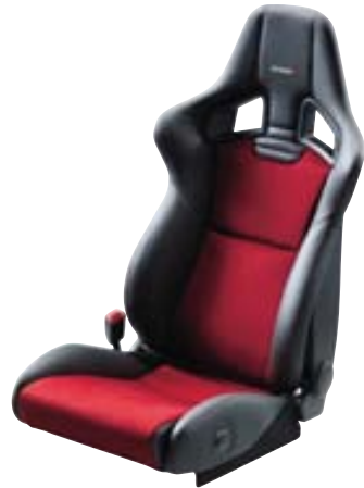
NISMO Carbon Fibre Recaro® Seats*