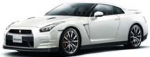
Storm White (QAB)