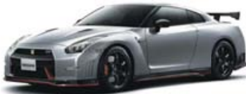
Ultimate Silver (KAB)