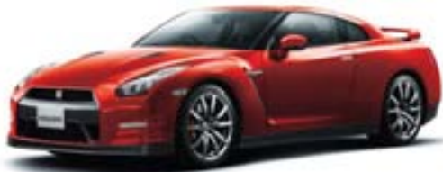
NEW Vermillion Red (NAS)