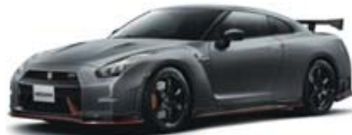
Stealth Grey (KBL)