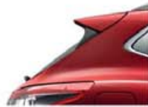
FLAME RED - S - Z10