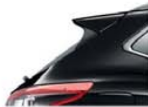
PEARL BLACK - M - Z11