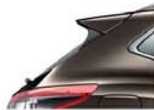
BRONZE - M - CAP NEW