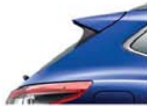
INK BLUE - M - RBN NEW