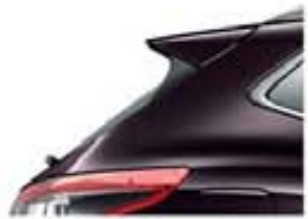
NIGHTSHADE - M - GAB