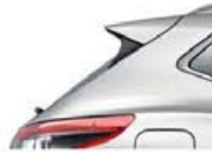
BLADE SILVER - M - KY0