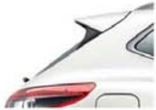
STORM WHITE - P - QAB