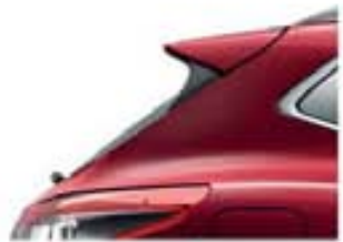
MAGNETIC RED - M - NAJ