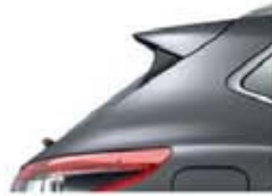
GUN METALLIC - M - KAD