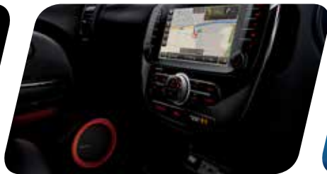
8 Speaker Infinity® audio system with external amplifier and subwoofer ('Connect Plus' upwards) The 8-speaker system has a subwoofer with external amplifier for superior sound quality and has been perfectly tuned to provide excellent sound quality in all driving.