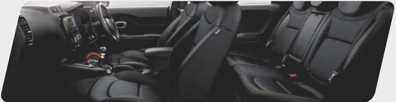
Black Woven with Yellow stitching (black one tone interior) upholstery is standard on the following Soul models: 'Connect' (Clear White and Inferno Red exterior colours only), 'Urban' and 'Connect Plus' (Clear White and Inferno Red exterior colours only) and 'Mixx' (Powder Blue and Clear White exterior colours only).