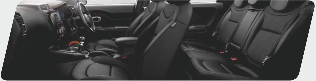
Black Woven and Tricot (black one tone interior) upholstery is standard on the Kia 'Start'.