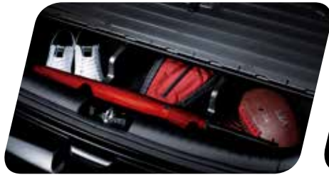
Luggage under-floor tray ('Mixx' upwards) A handy partitioned tray located under the floor of the luggage compartment is the perfect place to store emergency safety and car cleaning supplies.