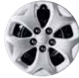
16" Steel Wheels

'Start' 1.6 litre GDi (petrol) 130 bhp 6-speed manual (153 g/km)