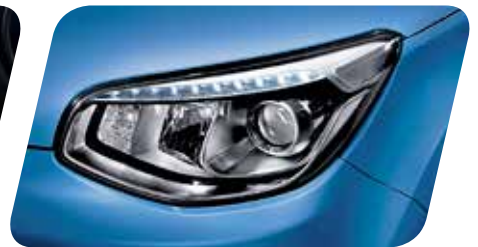
LED daytime running lights ('Urban', 'Mixx' and 'Maxx') Striking LED daytime running lights significantly improve visibility to oncoming traffic