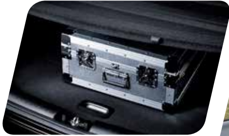
Luggage area load cover The screen helps you keep valuable items out of sight from prying eyes.