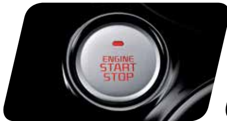
Engine start/stop button with smart entry system ('Maxx') The engine starts with one touch of the start/stop button which adds a sporty feel to the cabin.