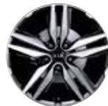
Premium 18" Alloy Wheels

'Maxx' 1.6 litre CRDi (diesel) 134 bhp 6-speed manual (128g/km)