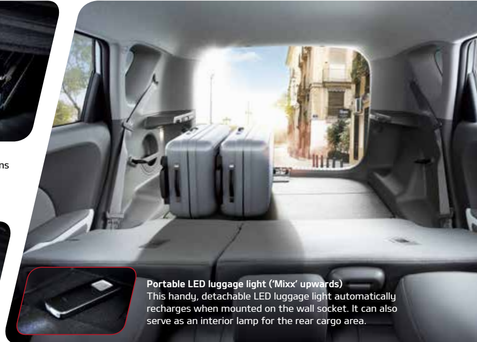
Portable LED luggage light ('Mixx' upwards) This handy, detachable LED luggage light automatically recharges when mounted on the wall socket. It can also serve as an interior lamp for the rear cargo area.