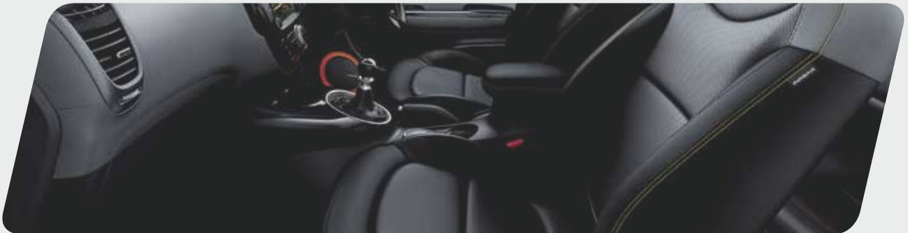
Grey and black woven with yellow stitching (grey two-tone interior) upholstery is standard on the following Soul models: 'Connect' (Quartz Black and Titanium Silver exterior colours only), 'Connect Plus' (Quartz Black and Titanium Silver exterior colours only) and 'Mixx' (Quartz Black and Inferno Red exterior colours only).