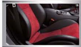
ELECTRIC SPORTS SEATS