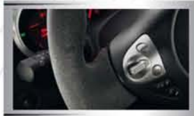
LEATHER ALCANTARA STEERING WHEEL