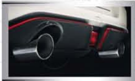
EXCLUSIVE EXHAUST SYSTEM