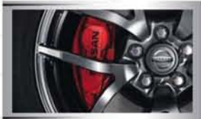
HIGH PERFORMANCE BRAKES