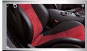
ELECTRIC SPORTS SEATS