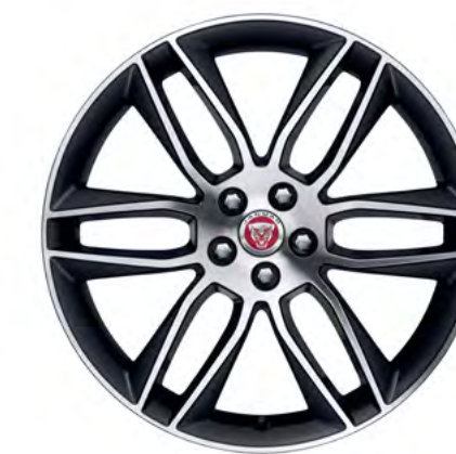
20" Style 6003, 6 split-spoke, Dark Grey Diamond Turned finish