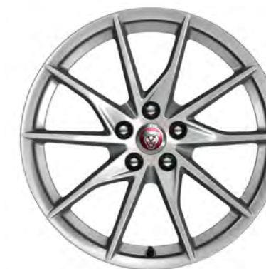
18" Style 1036, 10 spoke