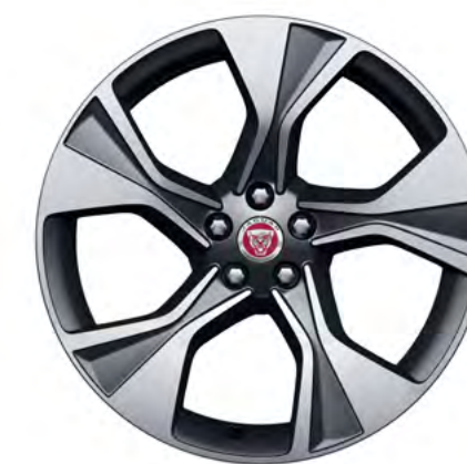
20" Style 5102, 5 spoke, Technical Grey Diamond Turned finish