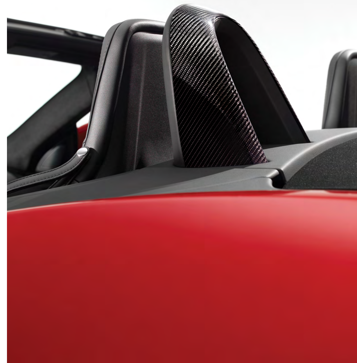
Silver Weave Carbon Fibre Roll Hoops