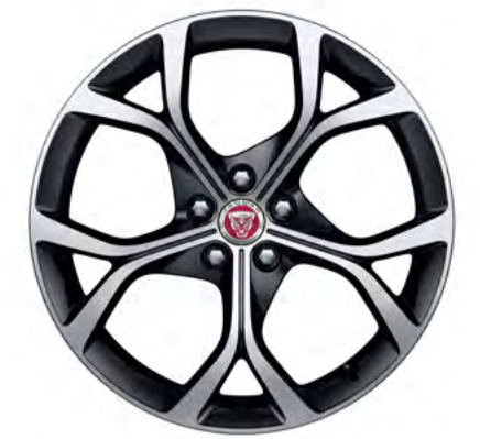
19" Style 5101, 5 split-spoke, Gloss Black Diamond Turned finish