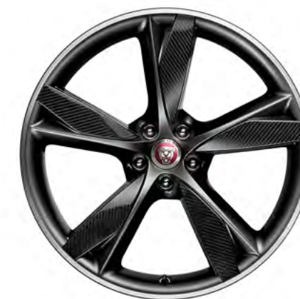
20" Style 5042, 5 spoke, Forged, Carbon Fibre and Satin Dark Grey Diamond Turned finish