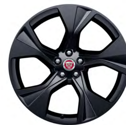
20" Style 5102, 5 spoke, Gloss Black