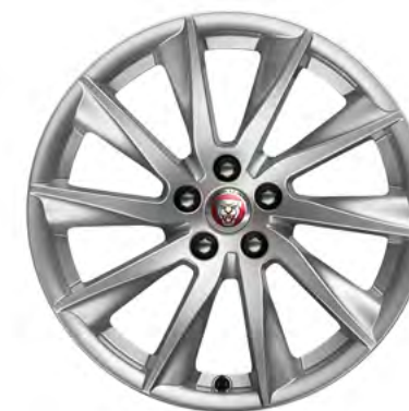
18" Style 1024, 10 spoke