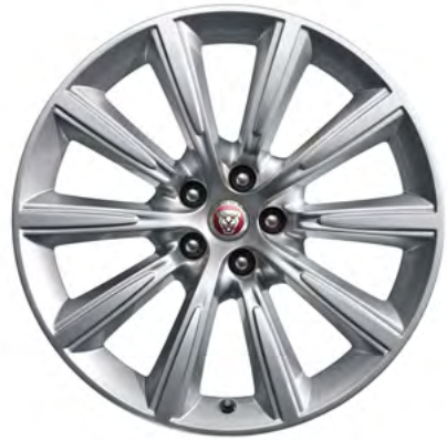
19" Style 1026, 10 spoke