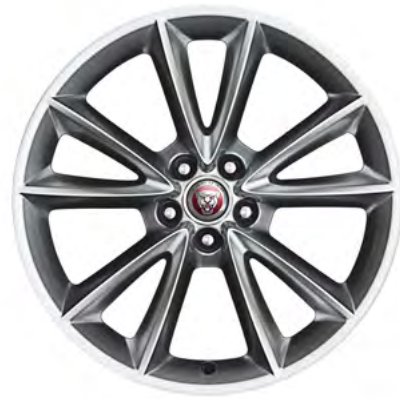
19" Style 5057, 5 split-spoke