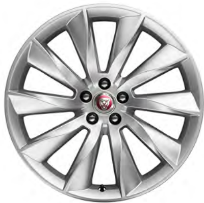
20" Style 1025, 10 spoke