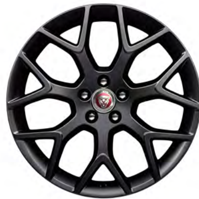
19" Style 7013, 7 split-spoke, Black