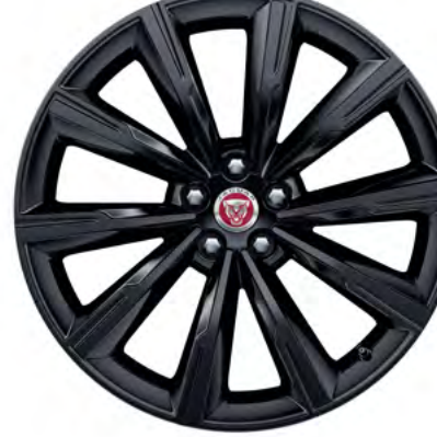
20" Style 1066, 10 spoke, Gloss Black