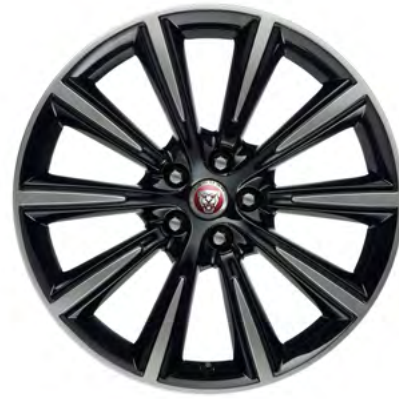
19" Style 1026, 10 spoke, Gloss Black Diamond Turned finish