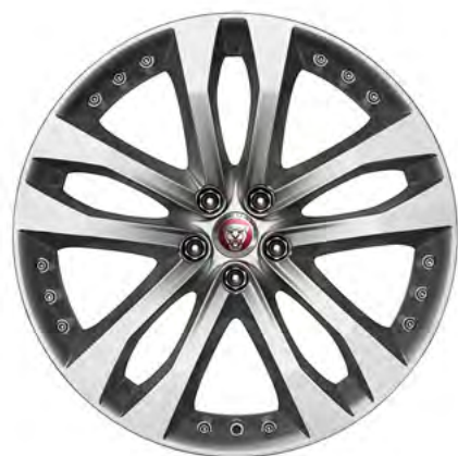
20" Style 5039, 5 split-spoke