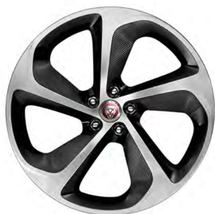
20" Style 5062, Forged, 5 spoke