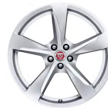
20" Style 5060, 5 spoke