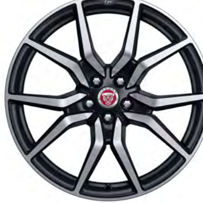
20" Style 1041, 10 spoke, Forged, Satin Black Diamond Turned finish