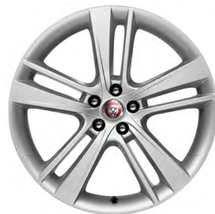
20" Style 5041, 5 split-spoke