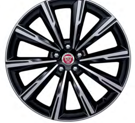
20" Style 1066, 10 spoke, Gloss Black Diamond Turned finish