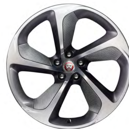
20" Style 5062, Forged, 5 spoke, Carbon Fibre Silver Weave