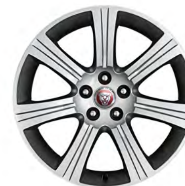
18" Style 7017, 7 spoke