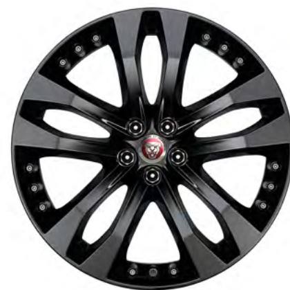
20" Style 5039, 5 split-spoke, Gloss Black