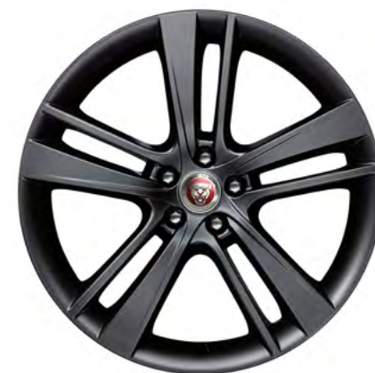
20" Style 5041, 5 split-spoke, Gloss Black