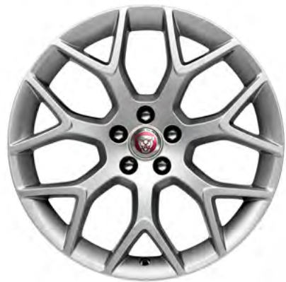
19" Style 7013, 7 split-spoke