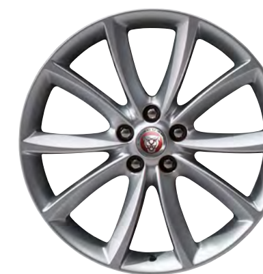
19" Style 1023, 10 spoke