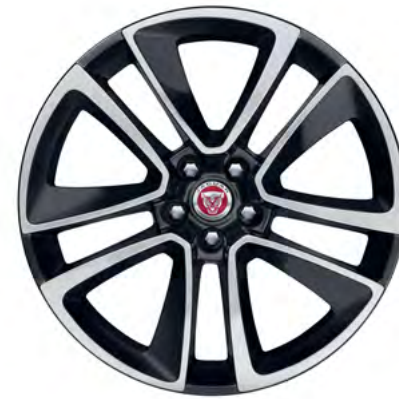
19" Style 5058, 5 split-spoke, Technical Grey Diamond Turned finish