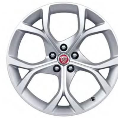
19" Style 5101, 5 split-spoke, Silver