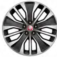
18" Style 5055, 5 split-spoke, Dark Grey Diamond Turned finish