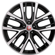
20" Style 5070, 5 split-spoke, Technical Grey Diamond Turned finish