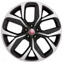
20" Style 5068, 5 spoke, Dark Grey Diamond Turned finish