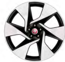
20" Style 6007, 6 spoke, Dark Grey Diamond Turned finish