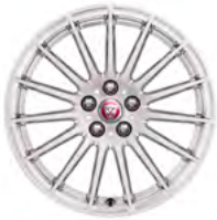
18" Style 1022, 15 spoke, Sparkle Silver

Personalise your vehicle with a selection of alloy wheels featuring a wide range of contemporary and dynamic designs.