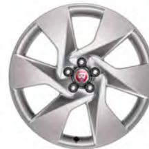
20" Style 6007, 6 spoke, Sparkle Silver