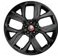
20" Style 5068, 5 spoke, Gloss Black