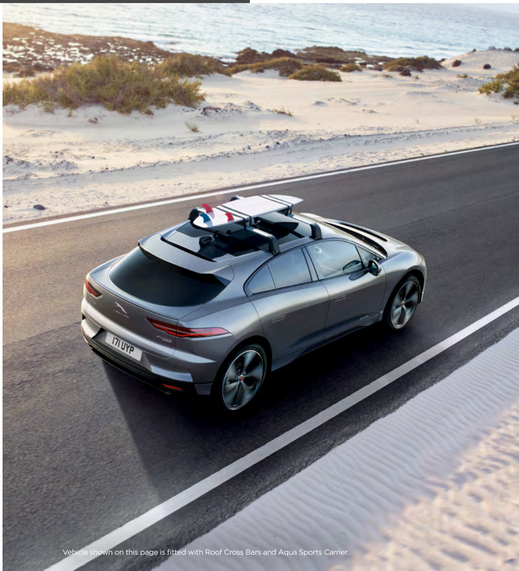
Vehicle shown on this page is fitted with Roof Cross Bars and Aqua Sports Carrier.