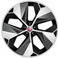
22" Style 5069, 5 spoke, Technical Grey with Carbon Fibre inserts