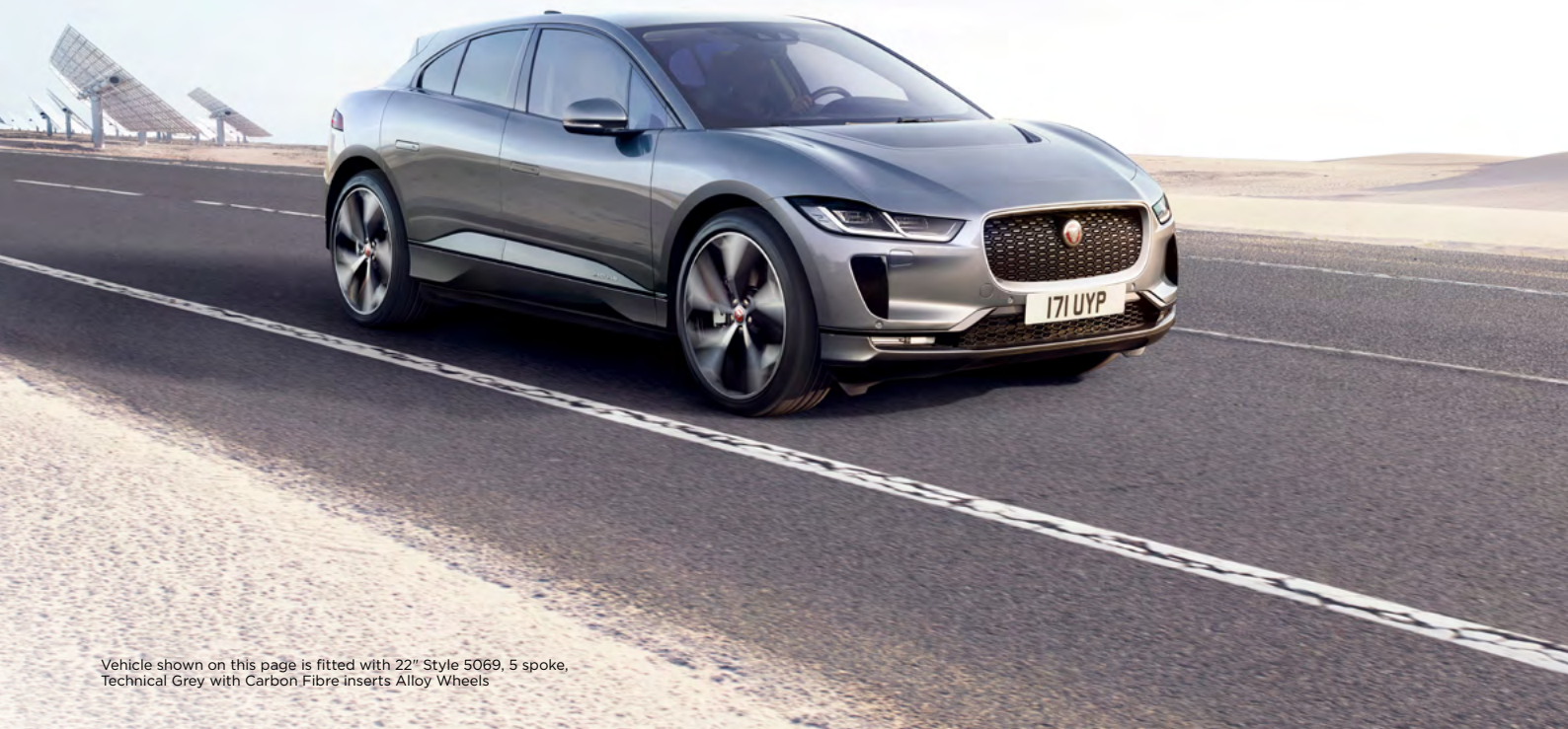
Vehicle shown on this page is fitted with 22" Style 5069, 5 spoke, Technical Grey with Carbon Fibre inserts Alloy Wheels