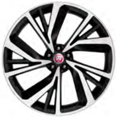
22" Style 5056, 5 split-spoke, Dark Grey Diamond Turned finish