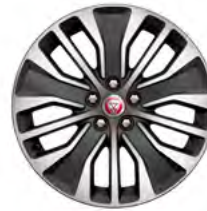
19" Style 5055, 5 split-spoke, Dark Grey Diamond Turned finish