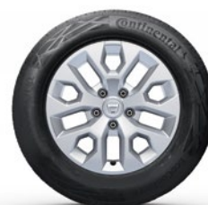
16" COMFORT ALLOY WHEEL