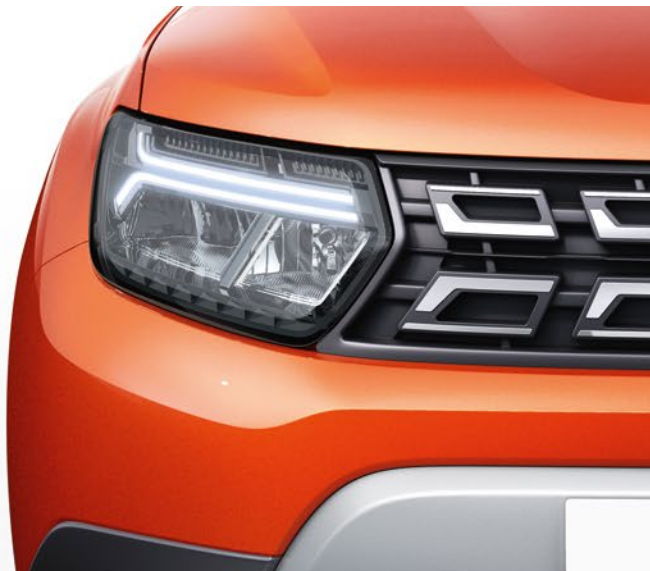
REDESIGNED FRONT END