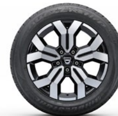
17" PRESTIGE ALLOY WHEEL