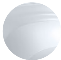
GLACIER WHITE (1)