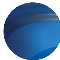
IRON BLUE (2)