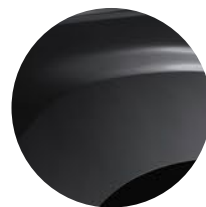
PEARL BLACK (2)