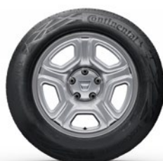
16" ESSENTIAL STEEL WHEEL