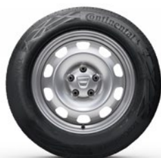
16" ESSENTIAL BI-FUEL STEEL WHEEL