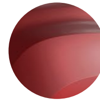
FUSION RED (2)