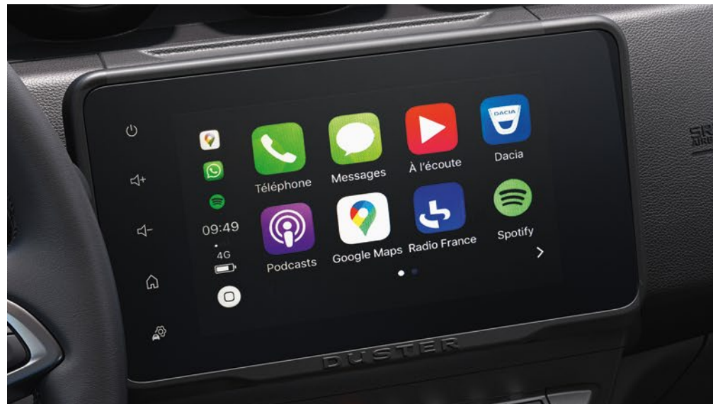
SMARTPHONE REPLICATION VIA APPLE CARPLAY™ OR ANDROID AUTO™ ON 8" TOUCH SCREEN