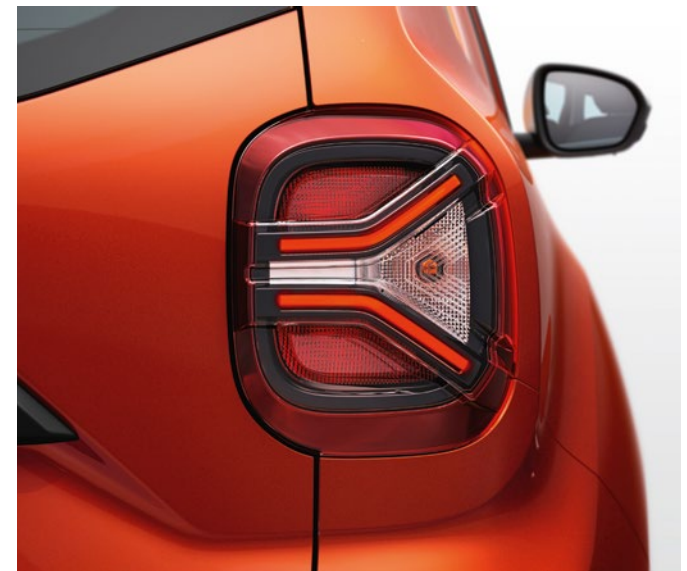
Y-SHAPED BRAND LIGHT