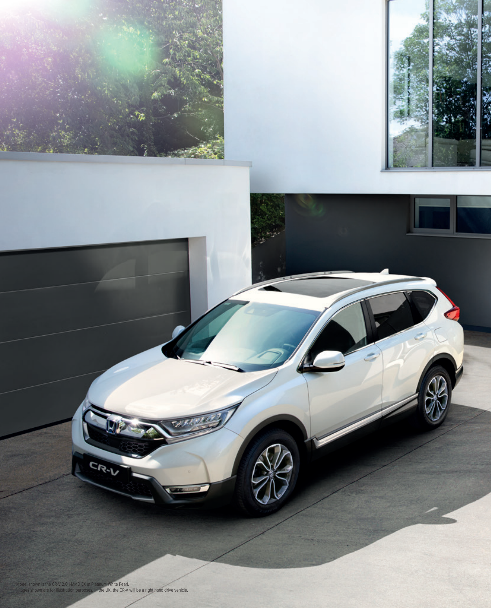
Model shown is the CR-V 2.0i-MMD EX in Platinum White Pearl. Images shown are for illustration purposes. In the UK, the CR-V will be a right hand drive vehicle.