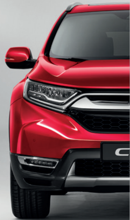
PREMIUM CRYSTAL RED METALLIC*

*Premium Crystal Red Metallic is only available on SR and EX grades. **Rallye Red is only available for S and SE grades and as a special order for SR and EX grades. ***Sport Line is only available in Crystal Black Pearl. Models shown are the CR-V 2.0 i-MMD EX. Images shown are for illustration purposes. In the UK, the CR-V will be a right hand drive vehicle.