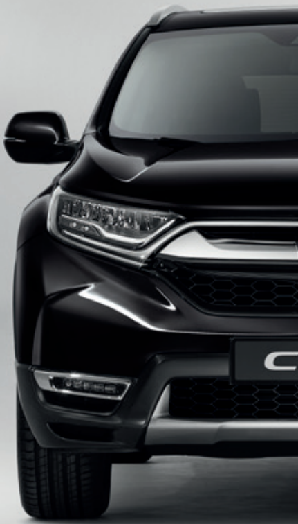
CRYSTAL BLACK PEARL***