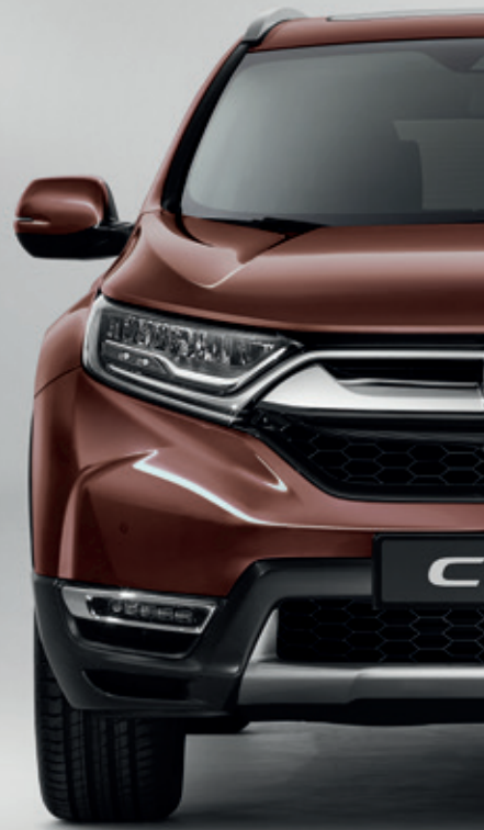
PREMIUM AGATE BROWN PEARL