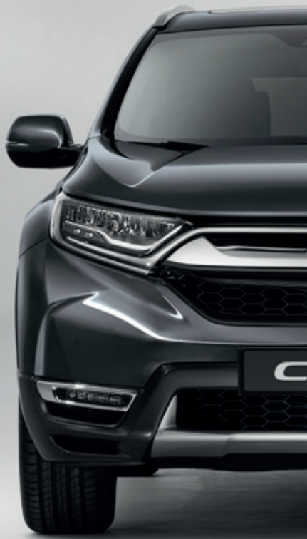
MODERN STEEL METALLIC