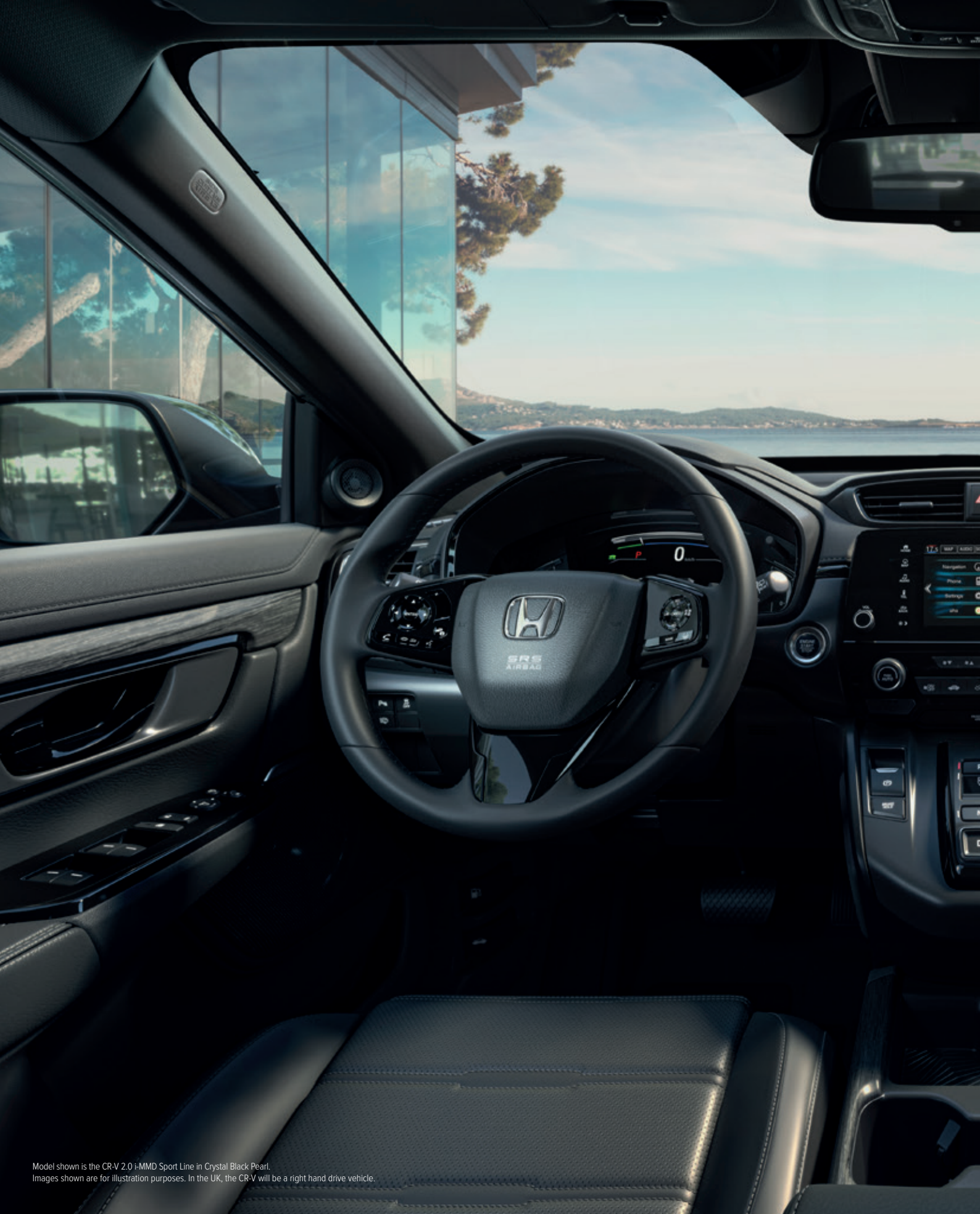
Model shown is the CR-V 2.0 i-MMD Sport Line in Crystal Black Pearl. Images shown are for illustration purposes. In the UK, the CR-V will be a right hand drive vehicle.