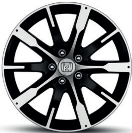
18" CR1801 ALLOY WHEEL

This alloy comes with Gunpowder Black windows and a diamond cut A-surface with shiny clear coat.