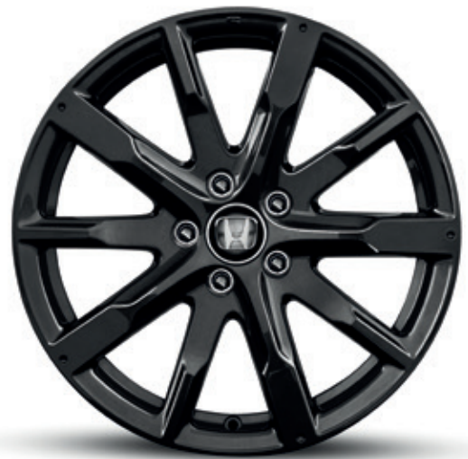
18" CR1802 ALLOY WHEEL

This alloy comes with Gunpowder Black windows and a diamond cut A-surface with shiny clear coat.