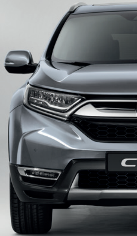
LUNAR SILVER METALLIC