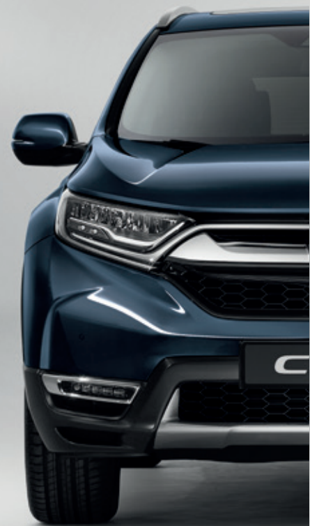
COSMIC BLUE METALLIC