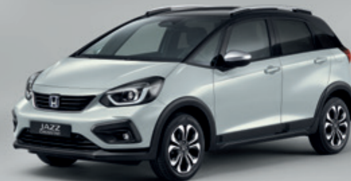
PREMIUM SUNLIGHT WHITE PEARL / TWO-TONE