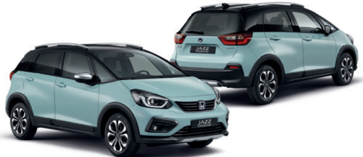
Image shows optional 16" JA1601 alloy wheels, applicable only on the EX grade

The Functional Fun pack is also available in Piano White.