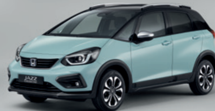
SURF BLUE / TWO-TONE