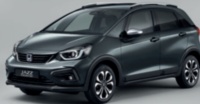
SHINING GRAY METALLIC