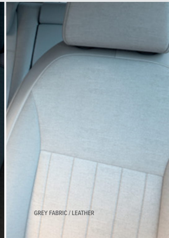
GREY FABRIC / LEATHER