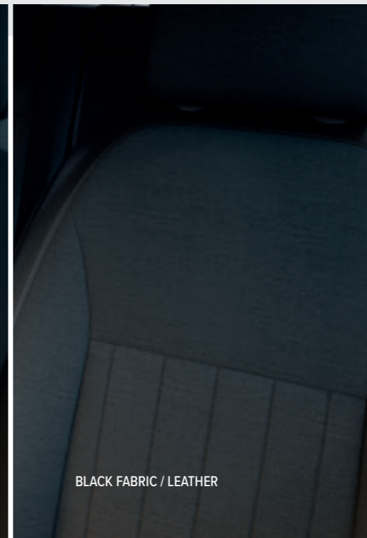
BLACK FABRIC / LEATHER