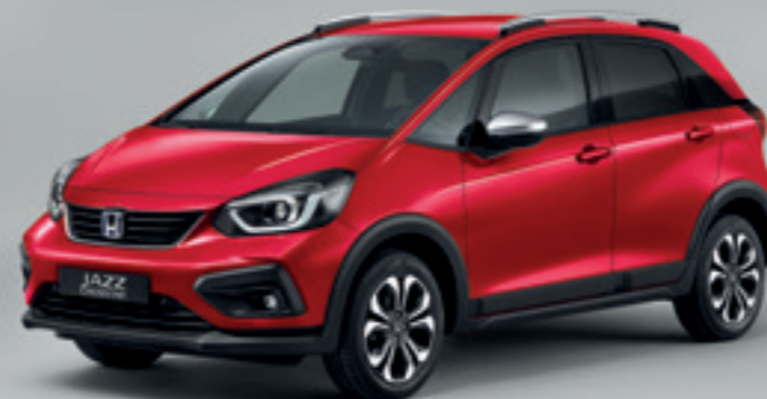
PREMIUM CRYSTAL RED METALLIC