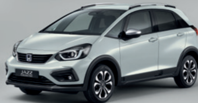
PREMIUM SUNLIGHT WHITE PEARL