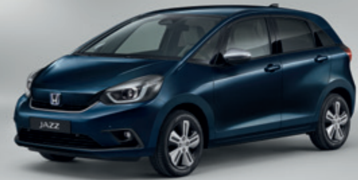
MIDNIGHT BLUE BEAM METALLIC