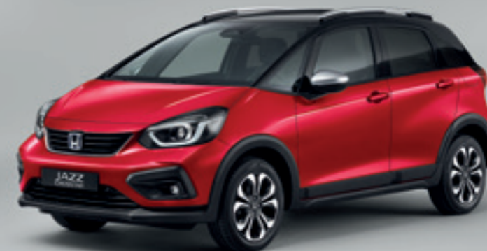
PREMIUM CRYSTAL RED METALLIC / TWO-TONE