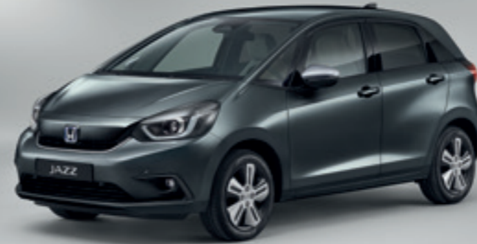
SHINING GRAY METALLIC