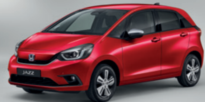
PREMIUM CRYSTAL RED METALLIC