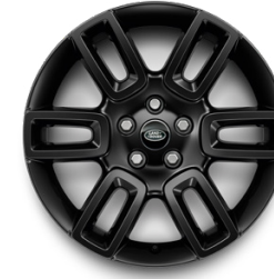
19" Style 6010, 6 spoke, Gloss Black