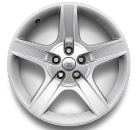
20" Style 5094, 5 spoke, Gloss Sparkle Silver