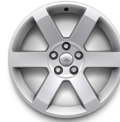
19" Style 6009, 6 spoke, Gloss Sparkle Silver