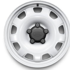
18" Style 5093, Gloss White, Steel