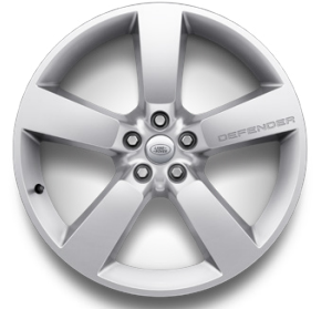
22" Style 5098, 5 spoke, Gloss Sparkle Silver