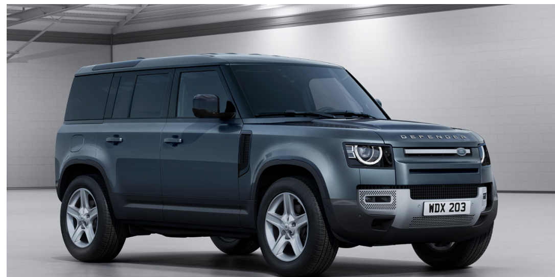
DEFENDER HARD TOP 110 SE FROM £61,150