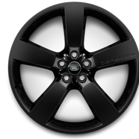
22" Style 5098, 5 spoke, Gloss Black