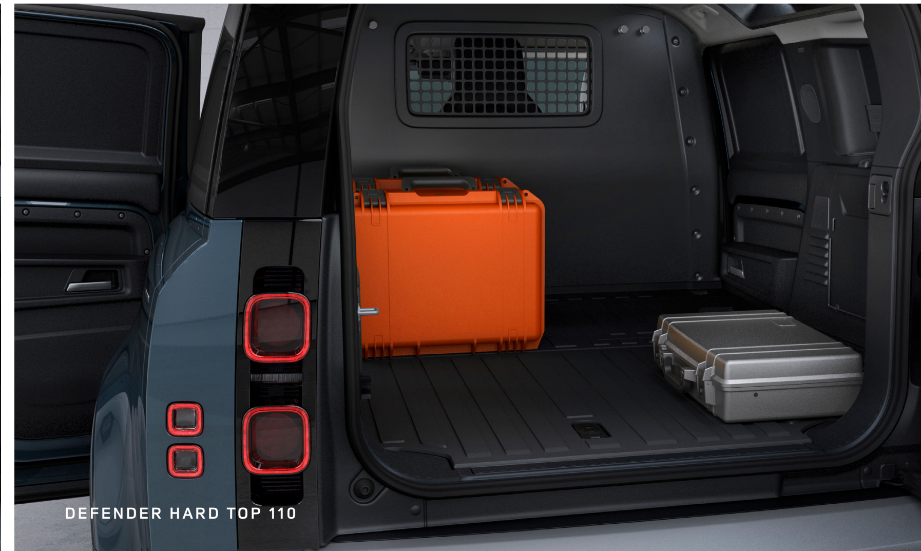
DEFENDER HARD TOP 110