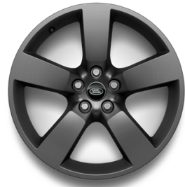
20" Style 5098, 5 spoke, Satin Dark Grey