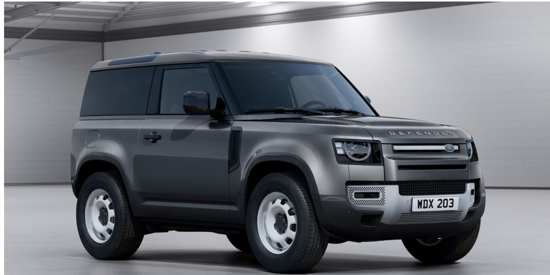
DEFENDER HARD TOP 90 FROM £45,675