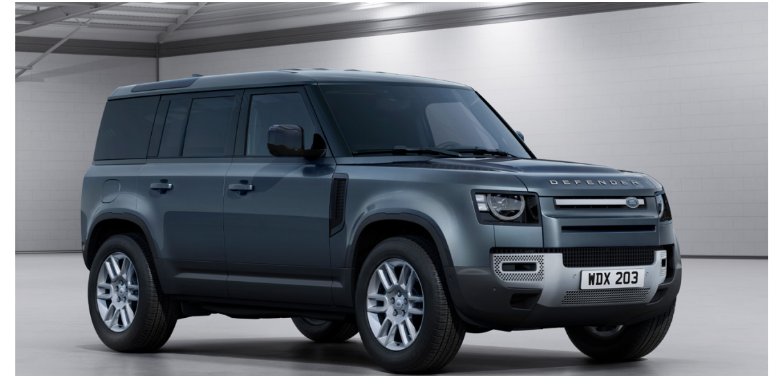
DEFENDER HARD TOP 110 S FROM £56,740