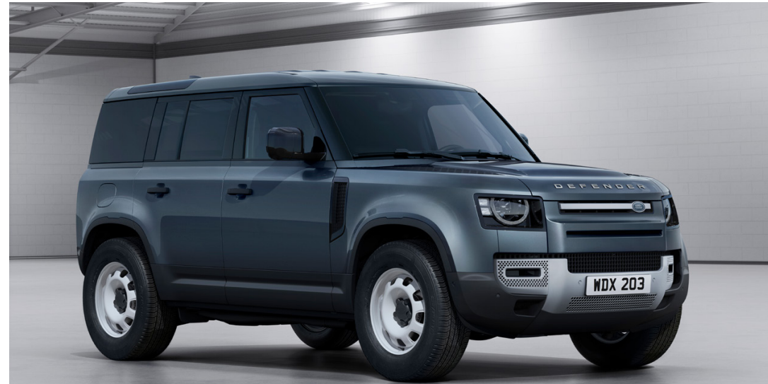
DEFENDER HARD TOP 110 FROM £53,745