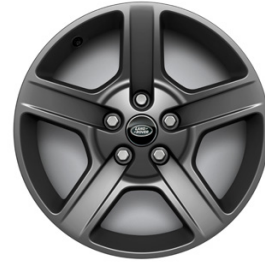
20" Style 5094, 5 spoke, Satin Dark Grey