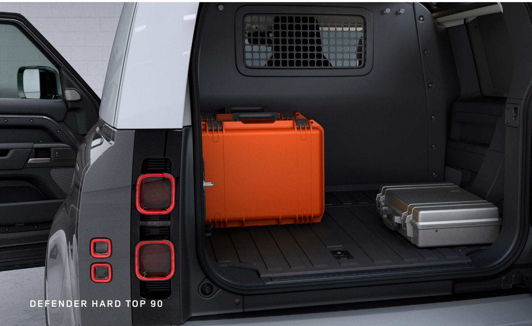
DEFENDER HARD TOP 90