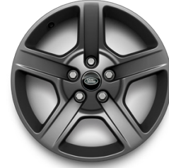
18" Style 5094, 5 spoke, Satin Dark Grey