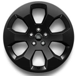
20" Style 6011, 6 spoke, Gloss Black