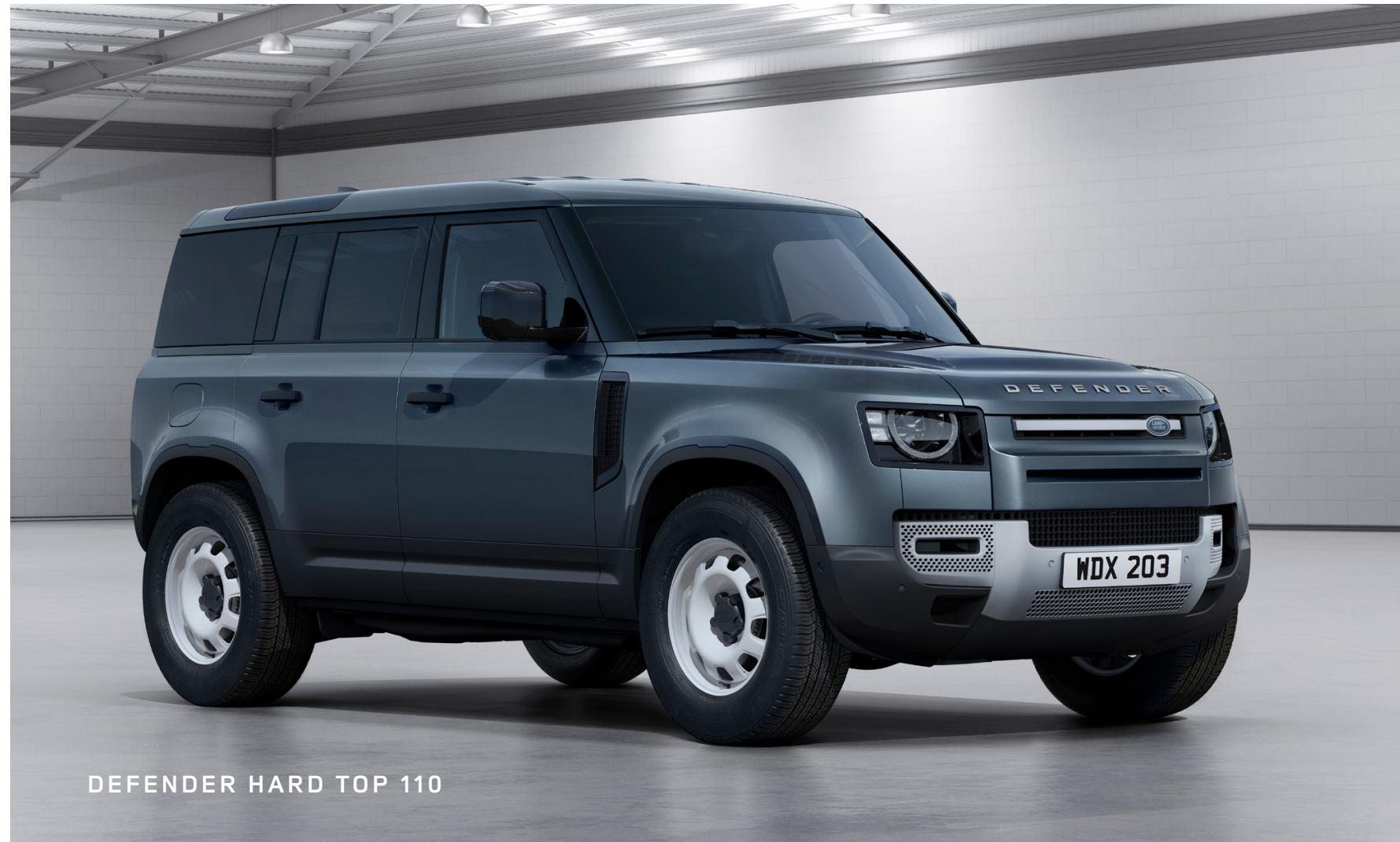
DEFENDER HARD TOP 110