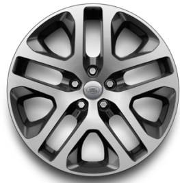
20" Style 5095, 5 split-spoke, Gloss Dark Grey with contrast Diamond Turned finish