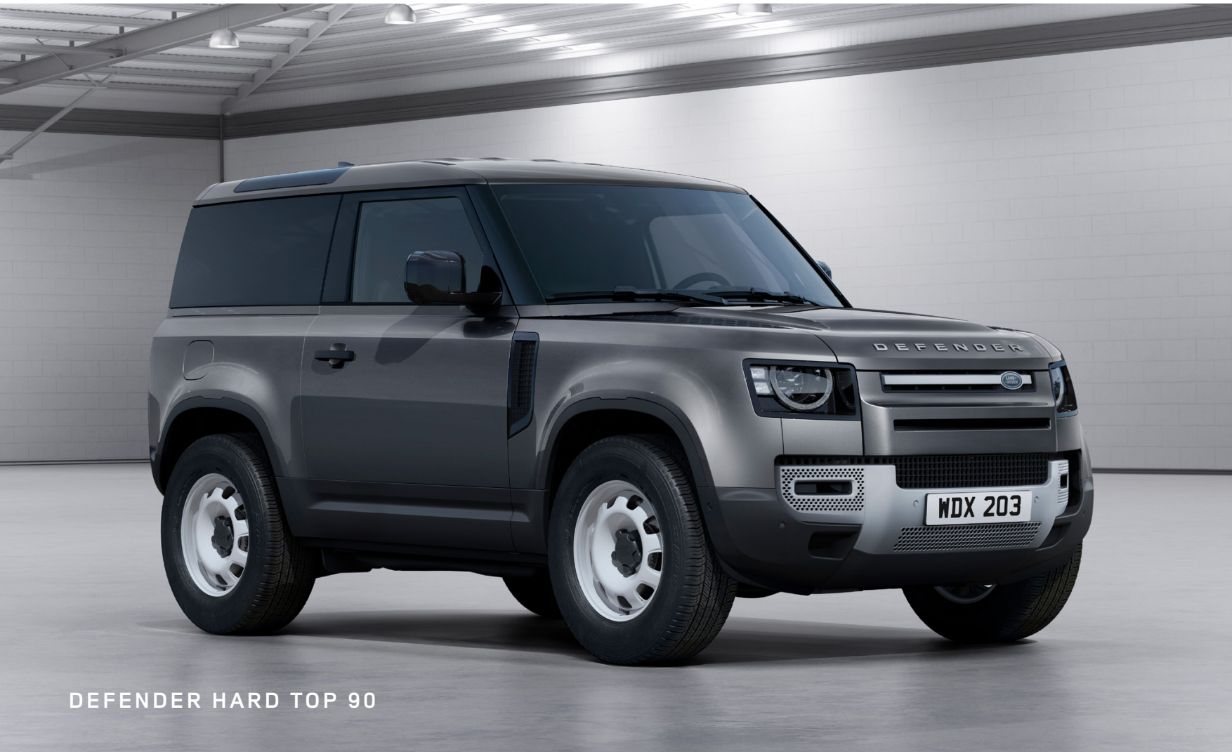
DEFENDER HARD TOP 90

Vehicles shown are Defender Hard Top 90 in Eiger Grey and Defender Hard Top 110 in Tasman Blue.