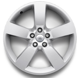
20" Style 5098, 5 spoke, Gloss Sparkle Silver