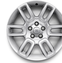
19" Style 6010, 6 spoke, Gloss Sparkle Silver