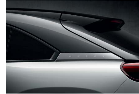
Ceramic Metallic with Brilliant Black roof and Dark Grey Metallic upper side panels