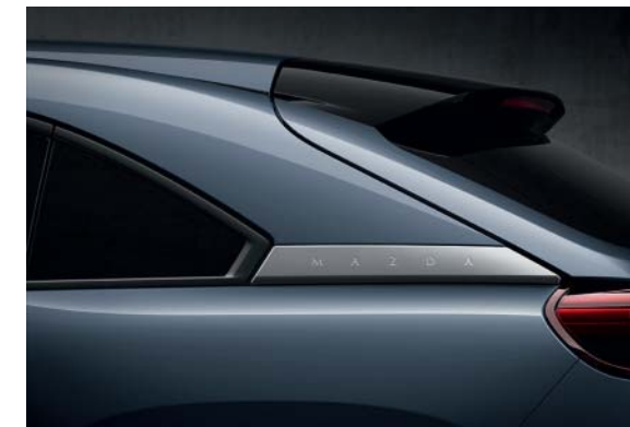
Polymetal Grey Metallic