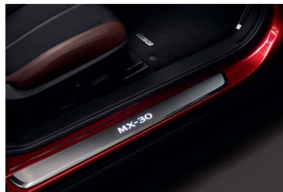
Illuminated Scuff Plates

We have created thoughtfully designed accessories for you to make the all-new Mazda MX-30 your own.