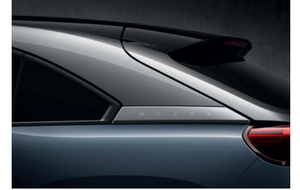
Polymetal Grey Metallic with Brilliant Black roof and Silver Metallic upper side panels