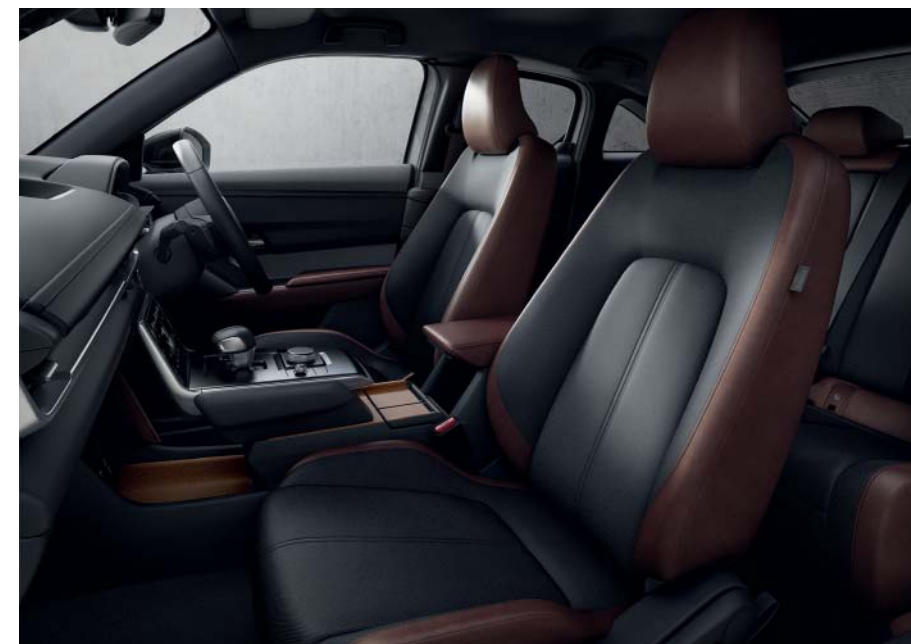
The Dark Grey cloth with Brown Leatherette interior is available on GT Sport Tech models at additional cost.