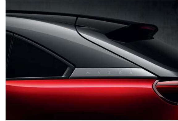
Soul Red Crystal Metallic with Brilliant Black roof and Dark Grey Metallic upper side panels

The exterior colour choices on the all-new Mazda MX-30 is one of the first things that will catch your attention. Its delicate beauty and strong character are endorsed by the craft of Takumi-Nuri, Mazda's high-quality painting technology, now expressed for the first time in the Framed Top options, where the roof is Brilliant Black and the side pillars are either a Silver or Dark Grey Metallic. Takumi-Nuri balances depth and glossiness to give the impression of a hand-painted concept car.