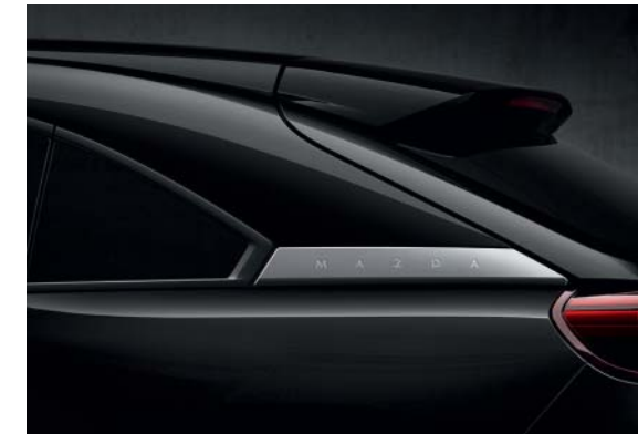
Jet Black Mica