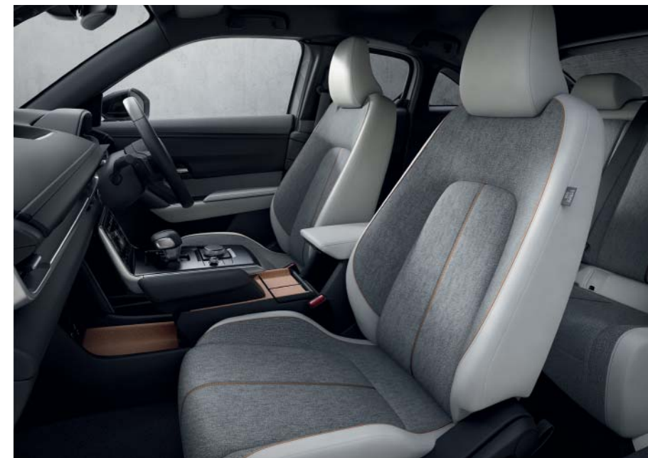
The Light Grey cloth with Stone Leatherette interior is standard on the First Edition, Sport Lux and GT Sport Tech models.