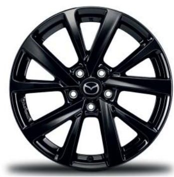
18-inch Black Alloy Wheels