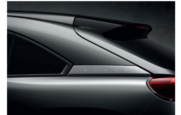
Machine Grey Metallic