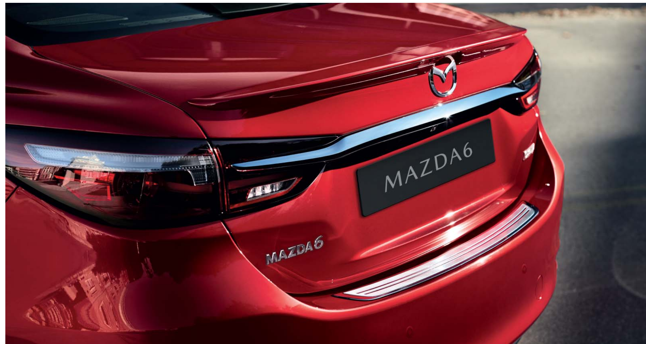
Rear bumper step plate and spoiler