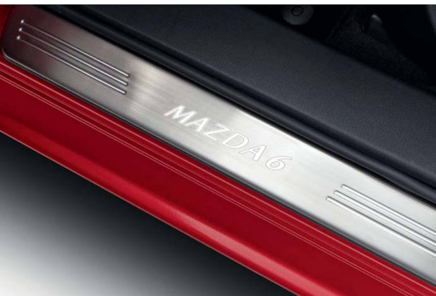
Illuminated scuff plates

Mazda has created thoughtfully designed accessories that perform seamlessly with your Mazda6.