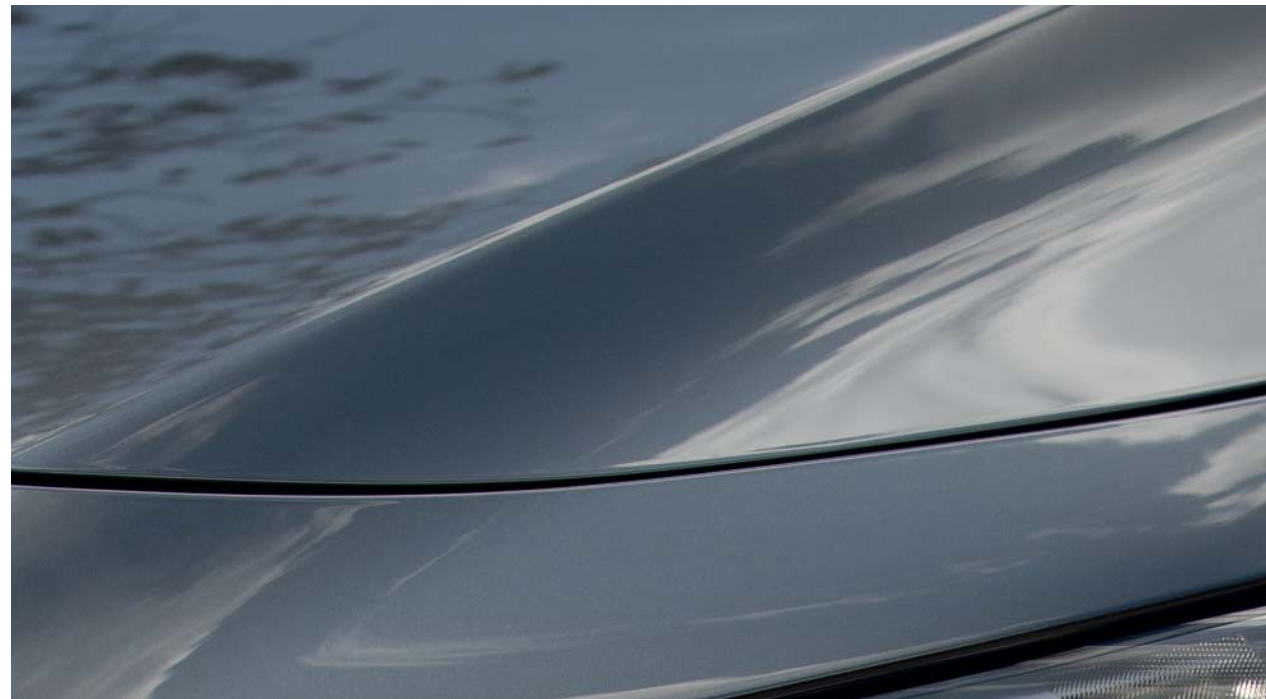
Machine Grey Metallic

The colour on the Mazda6 is one of the first things that will catch your attention. Its delicate beauty and strong character are endorsed by the craft of Takumi-Nuri, Mazda's high-quality painting technology, which makes the Kodo design come alive and amplifies the beauty of every line. Takumi-Nuri balances depth and glossiness to give the impression of a hand-painted concept car. It enables the exceptional vividness and depth achieved in the signature Soul Red Crystal and Machine Grey Metallic premium colours.