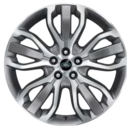
21" Style 5007, 5 split-spoke, Diamond Turned finish