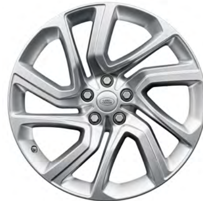
21" Style 5085, 5 split-spoke, Silver