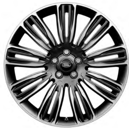
22" Style 9012, 9 split-spoke, Mid-Silver Diamond Turned finish