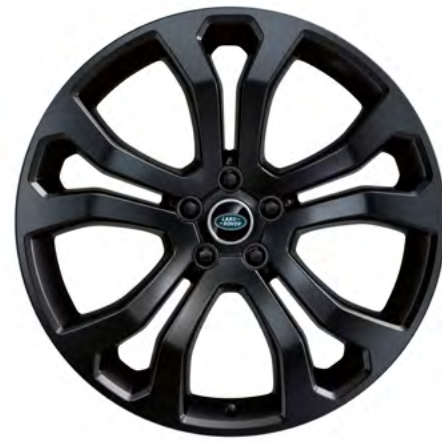
22" Style 5014, 5 split-spoke, Forged, Fully Painted with Low Gloss Black