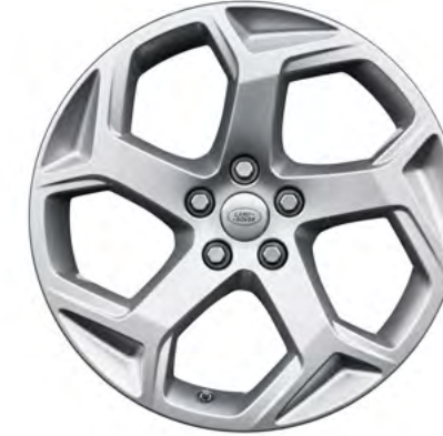
20" Style 5084, 5 split-spoke, Silver