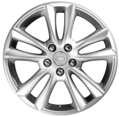
19" Style 5001, 5 split-spoke

Personalise your vehicle with a selection of alloy wheels featuring a wide range of contemporary and dynamic designs.