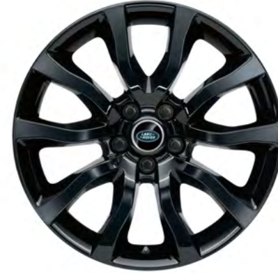
20" Style 5020, 5 split-spoke, Gloss Black