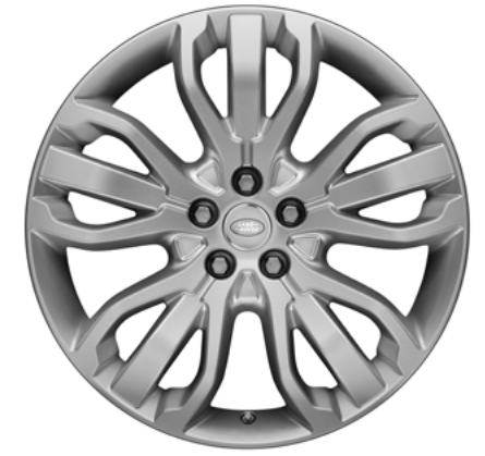
21" Style 5007, 5 split-spoke