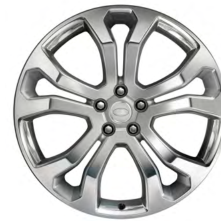
22" Style 5014, 5 split-spoke, Forged, Machine Polished