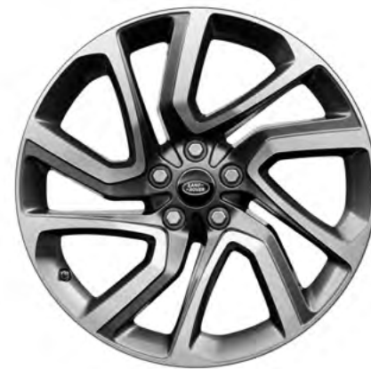
21" Style 5085, 5 split-spoke, Diamond Turned finish