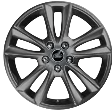
19" Style 5001, 5 split-spoke, Anthracite