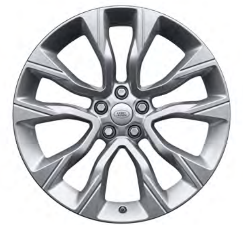
22" Style 5086, 5 split-spoke, Silver