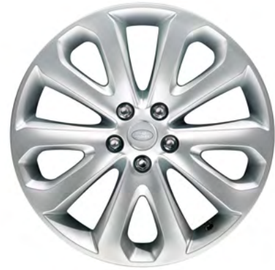
20" Style 5002, 5 split-spoke