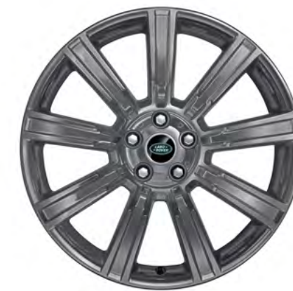
21" Style 9001, 9 spoke, Forged, Technical Grey