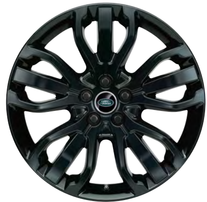
21" Style 5007, 5 split-spoke, Forged, Gloss Black