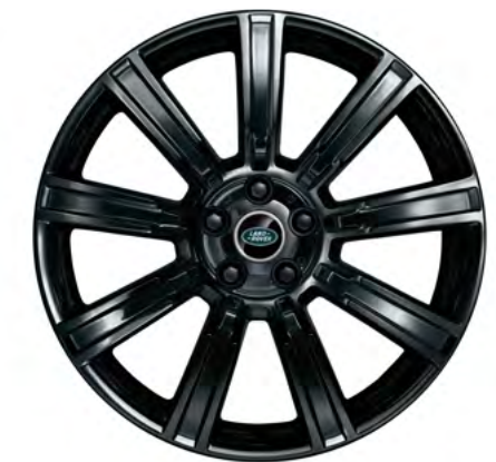
21" Style 9001, 9 spoke, Forged, Satin Black