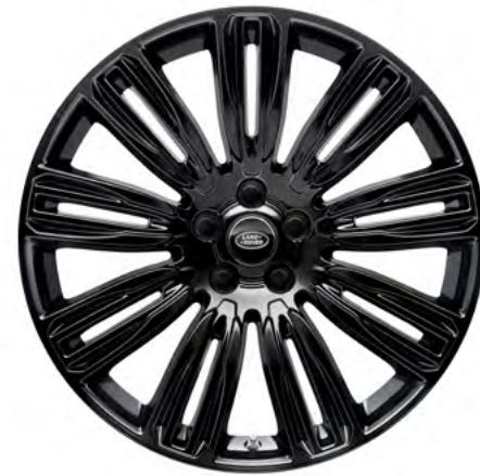
22" Style 9012, 9 split-spoke, Gloss Black