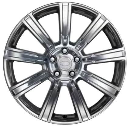
21" Style 9001, 9 spoke, Forged, Full Machine Polished

Personalise your vehicle with a selection of alloy wheels featuring a wide range of contemporary and dynamic designs.