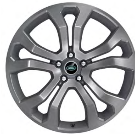
22" Style 5014, 5 split-spoke, Forged, Fully Painted with Technical Grey Gloss