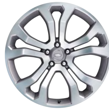
22" Style 5014, 5 split-spoke, Forged, Ceramic Polished Light Silver