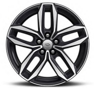
20" Twin 5-spoke aluminum wheels with Diamond Cut/Titan Satin finish