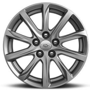
18" 10-spoke aluminum wheels with Bright Silver finish