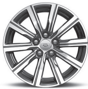
18" 10-spoke aluminum wheels with Diamond Cut/Argent Metallic finish