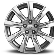
20" 9-spoke aluminum wheels with Diamond Cut/Medium Android finish