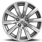
18" 10-spoke aluminum wheels with Pearl Nickel finish