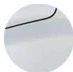
MOONSTONE GREY (1)