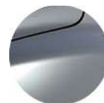
SLATE GREY (1)