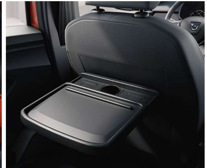
SLIDING TRAY TABLES AT THE REAR

*minimum boot volume of 160 L and a maximum of 1,807 L, depending on the version and configuration of the passenger compartment.