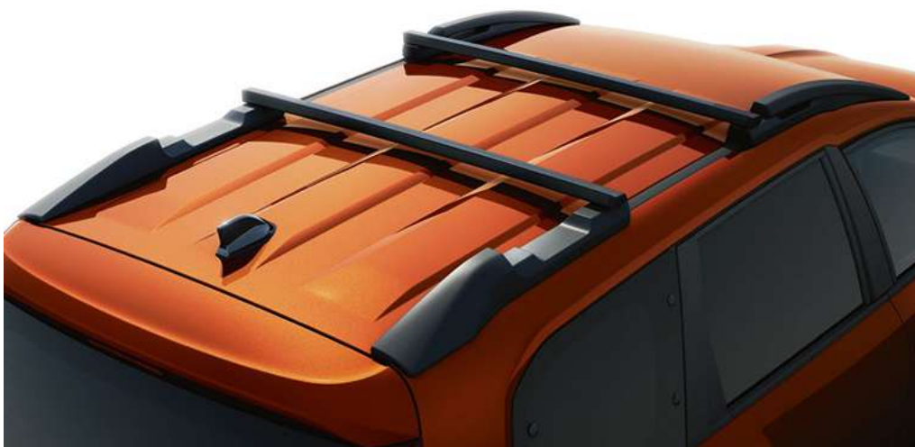
MODULAR ROOF BARS WITH A FEW TURNS OF THE KEY

access to the boot. Go all out with the Extreme Limited Edition: black-clad wheel arches, alloy wheels, door mirrors and shark-fin aerial. Distinctive stickers and protective Megalith Grey skid plates. All-New Dacia Jogger, designed for you and your family.