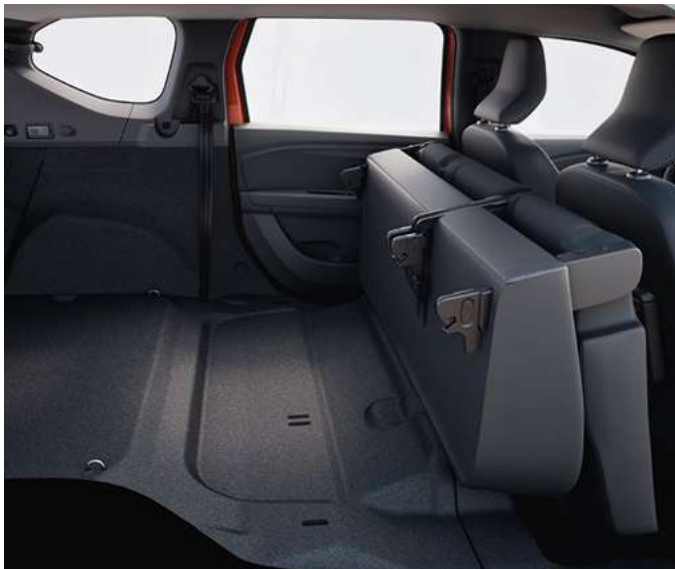
CAN BE CONFIGURED AS A 2, 3, 4, 5, 6 OR 7-SEATER

For long items, there's up to 1,807 litres of cargo space with the bench seat folded down. Make your journey more enjoyable and find your route with the multimedia system: 8-inch touch screen with Navigation, smartphone replication via wifi*, Bluetooth connection everything is there. A true Swiss Army knife style! *depending on the version