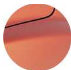
TERRACOTTA BRONZE (1)