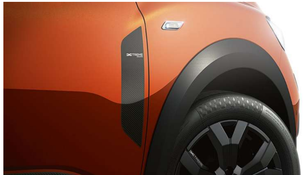
FLUSH WHEELS AND PRONOUNCED ARCHES