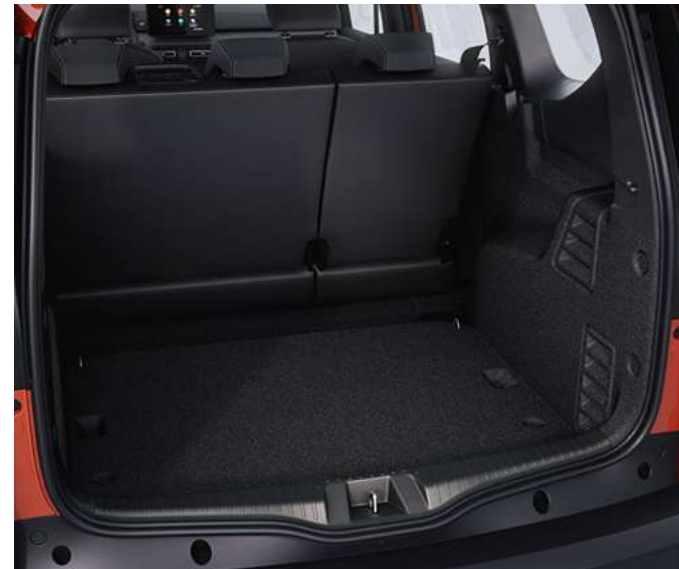
FROM 160 TO 1,807 LITRES OF BOOT VOLUME

*minimum boot volume of 160 L and a maximum of 1,807 L, depending on the version and configuration of the passenger compartment.