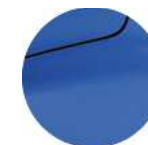
IRON BLUE (1)(3)

(1) Metallic colours - (2) Opaque colours (3) not available on the Extreme SE