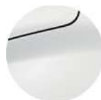
GLACIER WHITE (2)