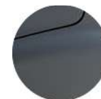
PEARL BLACK (1)