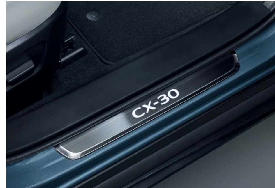
Illuminated Scuff Plates

Mazda has created thoughtfully designed accessories that perform seamlessly with your Mazda CX-30.