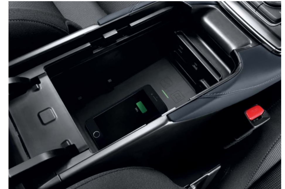
Qi Standard Wireless Charger