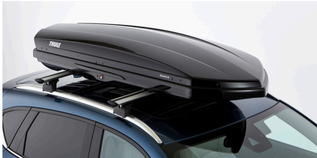
Thule Roof Box - Dynamic M