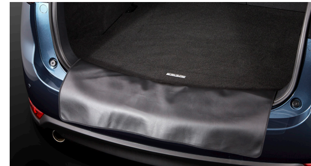
Boot Mat with Rear Bumper Protection