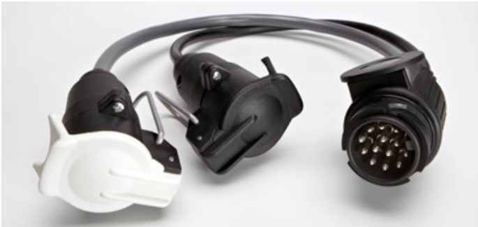
Tow Bar Wiring Adapters