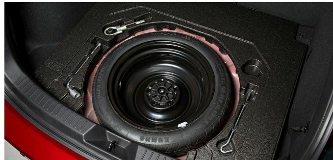
Space Saver Spare Wheel Kit