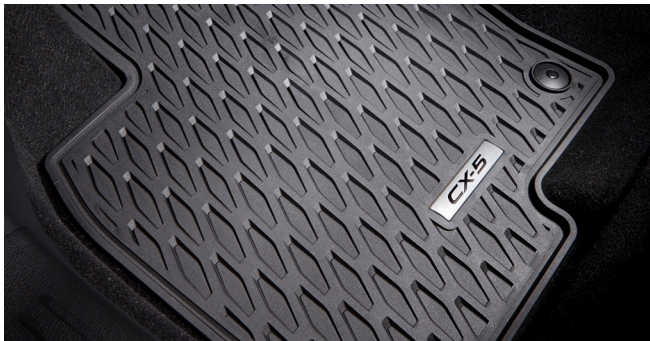
100% Recycled All Weather Mats