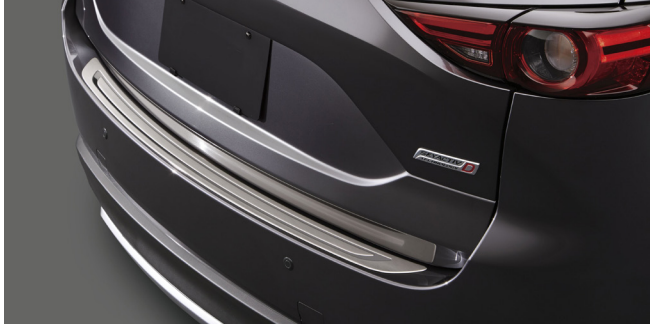
Stainless Steel Rear Bumper Protection Plate