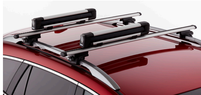
Thule Ski and Snowboard Attachment