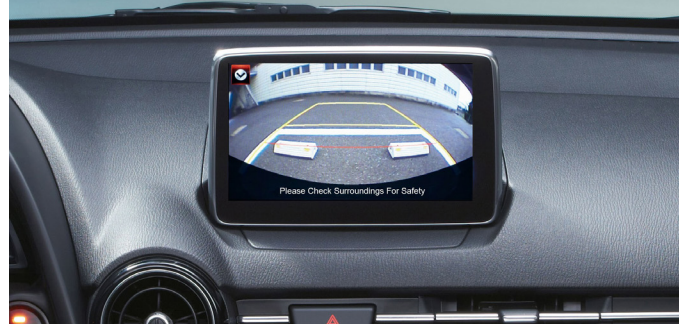
Rear Parking Camera*