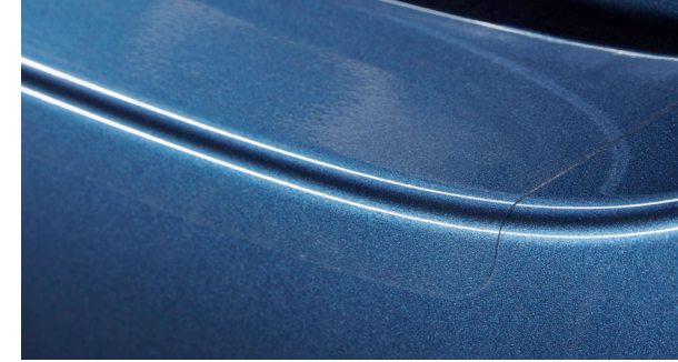
Door Sill Protection Strip