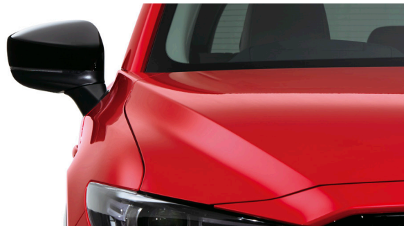
Door Mirror Covers - Silver or Black