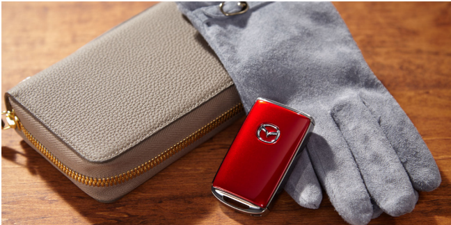
Key Cover (Various Colours)