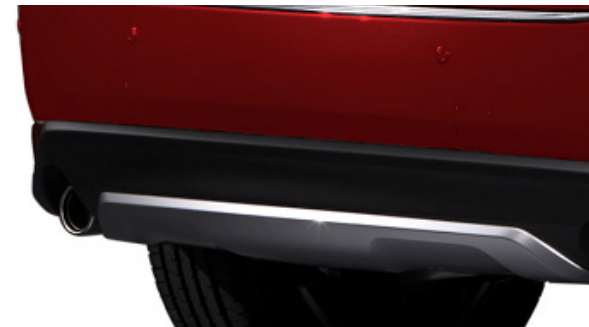
Rear Under Trim