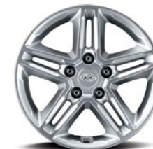
16" alloy wheel Standard on Essential models