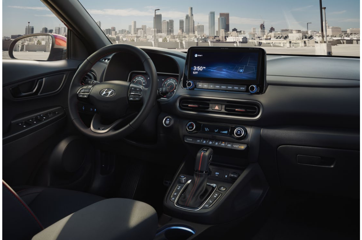
N Line model with Ultimate package shown.

Outside, the newly re-designed KONA makes a bold statement. Inside, the KONA lets its exceptional level of comfort and wealth of features do the talking. The new KONA thinks of you with its standard heated front seats, an available heated steering wheel and an available 8-way power-adjustable driver's seat. When city life heats up, the KONA helps keep you cool with available ventilated front seats.