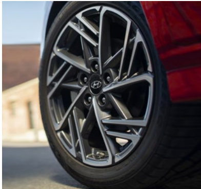
Available 18" alloy wheels