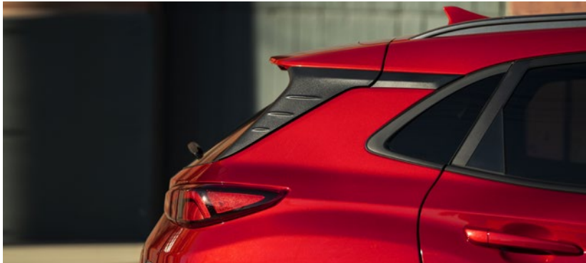
Available LED tail lights Standard rear spoiler