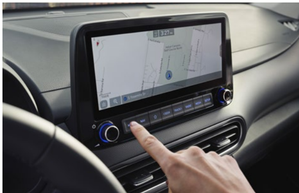
Available 10.25" touch-screen with navigation system