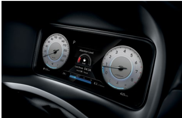
Available 10.25" full digital instrument cluster

Shopping across town? Late-night eats? Get around seamlessly with these impressive features.