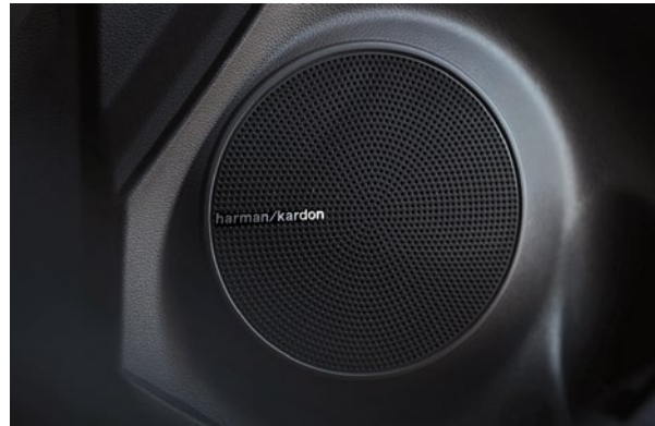
Available harman/kardon® premium audio system with 8 speakers