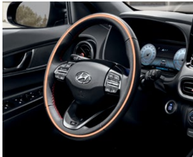
Available heated steering wheel