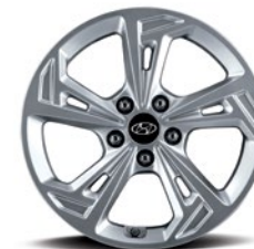
17" alloy wheel Standard on Preferred models