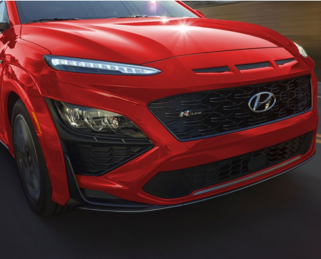
Standard LED daytime running lights Available LED headlights

The new KONA features a distinctive grille design that complements the refreshed headlight cluster. The narrow, piercing look of the standard LED daytime running lights remains a signature and unmistakable design cue. The bold design is reinforced with body cladding details along the wheel arches and rear bumper.