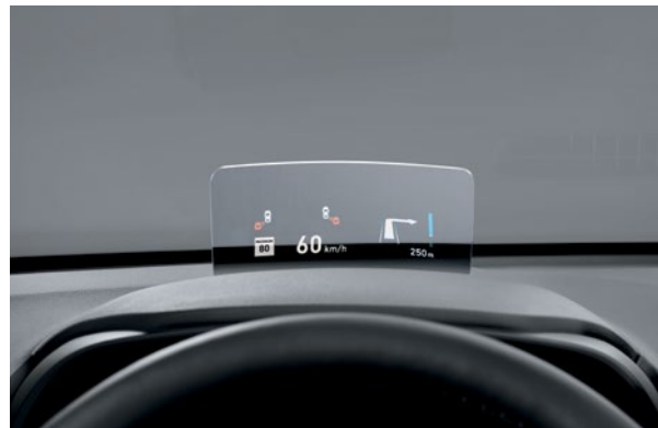
Available head-up display