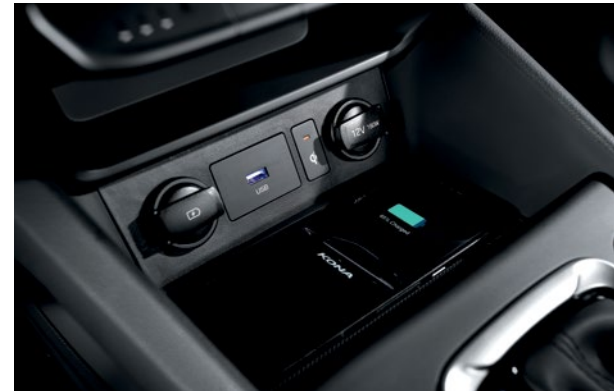
Available wireless charging pad▼