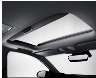
Available power sunroof