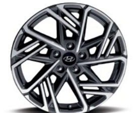
18" alloy wheel Standard on N Line model and N Line model with Ultimate package