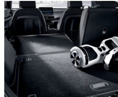
Standard 60/40 split-fold rear seats