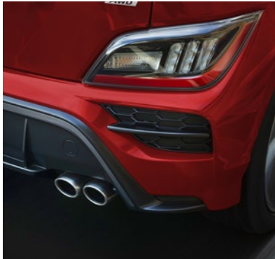
Available twin-tip exhaust