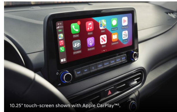
10.25" touch-screen shown with Apple CarPlay™.