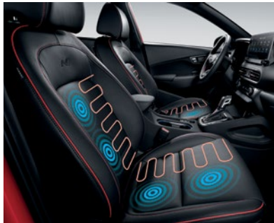
Standard heated front seats Available ventilated front seats