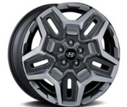
19" alloy wheel Standard on Preferred model with Plug-in Hybrid, Urban model, Luxury Plug-in Hybrid model and Luxury Hybrid model