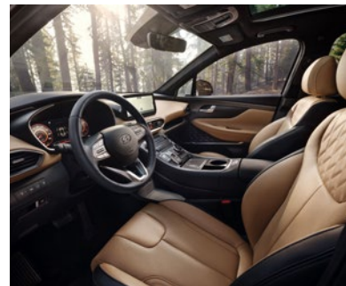
Available 8-way power-adjustable driver's seat with lumbar support and power thigh extension