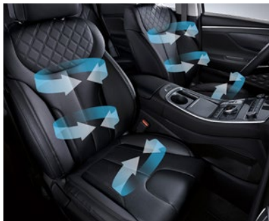
Standard heated front seats and available ventilated front seats