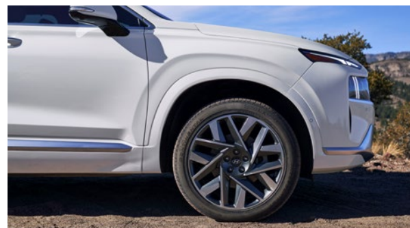
Available 20" alloy wheels