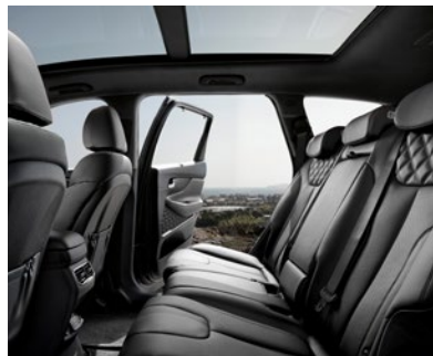
Available panoramic sunroof