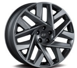
20" alloy wheel Standard on Ultimate Calligraphy model