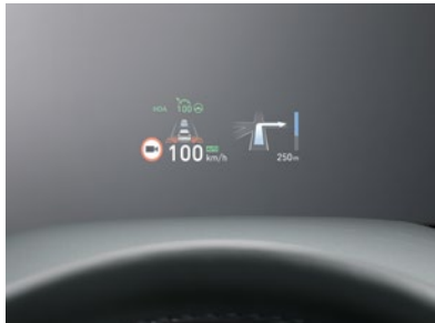
Available head-up display

Enjoy the convenience that a wide range of SANTA FE features will bring into your life. For instance, the available smart power liftgate lets you load up your cargo hassle-free, while the available surround view monitor makes parking easier with a 360-degree aerial view of your surroundings. You can even charge your smartphone by just slotting it into the available wireless device charging area ▼ .