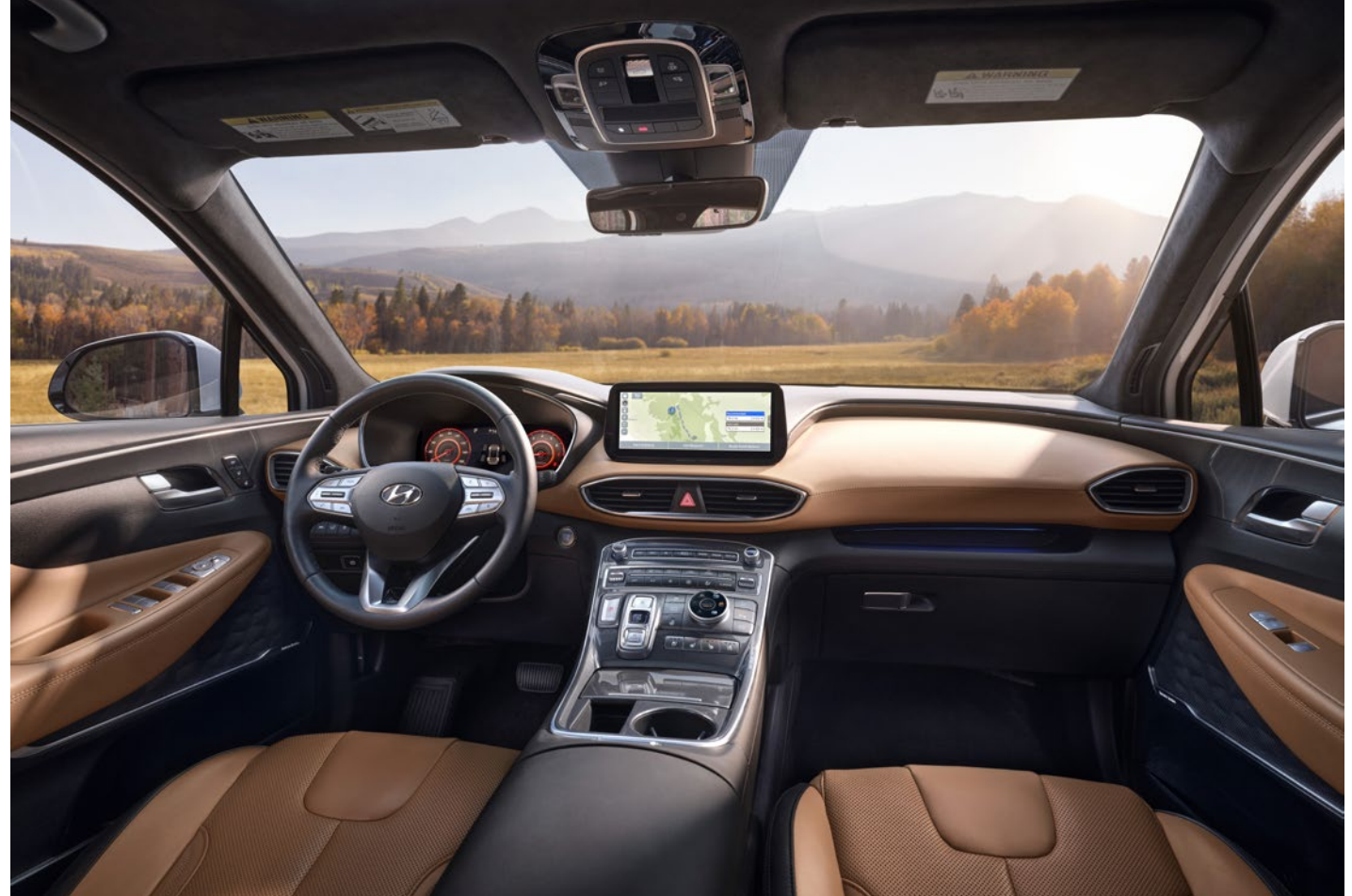
Ultimate Calligraphy model shown. May not be exactly as shown.

A sophisticated floating centre console design sets the stage for the luxury you are surrounded by. The interior of the SANTA FE features a convenient shift-by-wire layout that replaces the traditional gear shifter configuration with intuitive button selection, offering a clean design and maximized storage space. The spacious cabin feels even larger when the available panoramic sunroof is wide open on a beautiful sunny day.