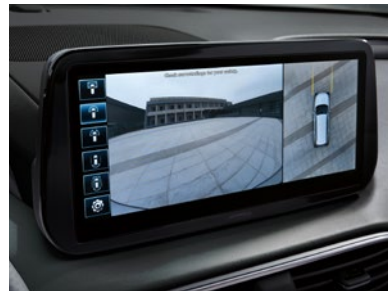
Standard 10.25" touch-screen with navigation and available surround view monitor