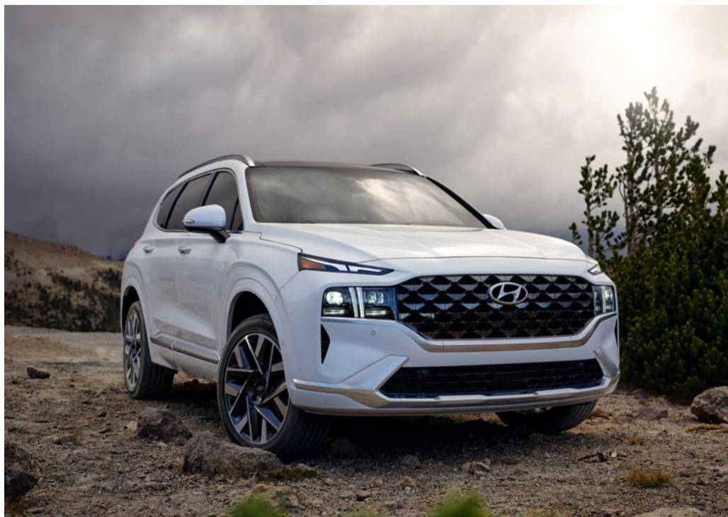
Standard LED headlights and LED daytime running lights with signature T-shaped design

Up front, the grille showcases a balanced design with a unique T-shaped lighting signature, featuring LED headlights and LED daytime running lights. A sharp side character line runs alongside the shoulder, delivering a muscular stance that seamlessly flows into the unique LED tail light design which is connected end-to-end by a centre reflector strip. Every angle has been elegantly crafted.