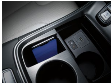
Available wireless charging pad ▼