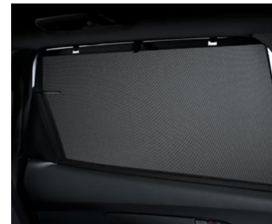
Available rear window sunshade blinds