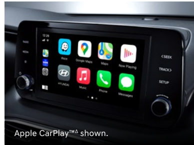
Apple CarPlay ™ shown.