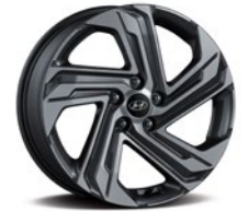
18" alloy wheel Standard on Preferred model