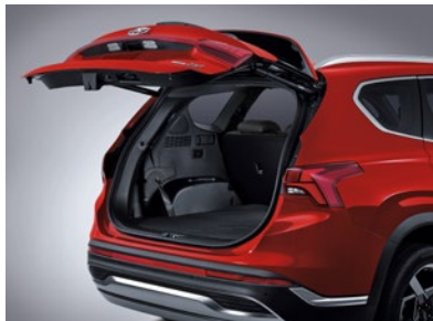
Available smart power liftgate