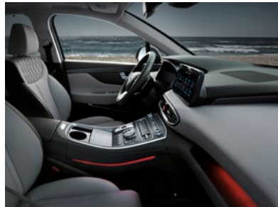
Available interior ambient lighting