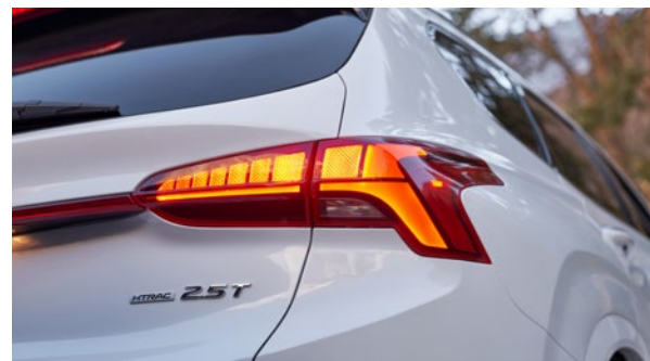
Available LED tail lights