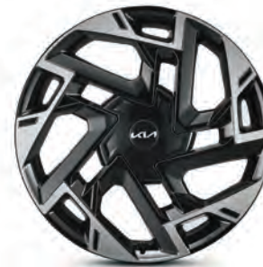
19" alloy wheels