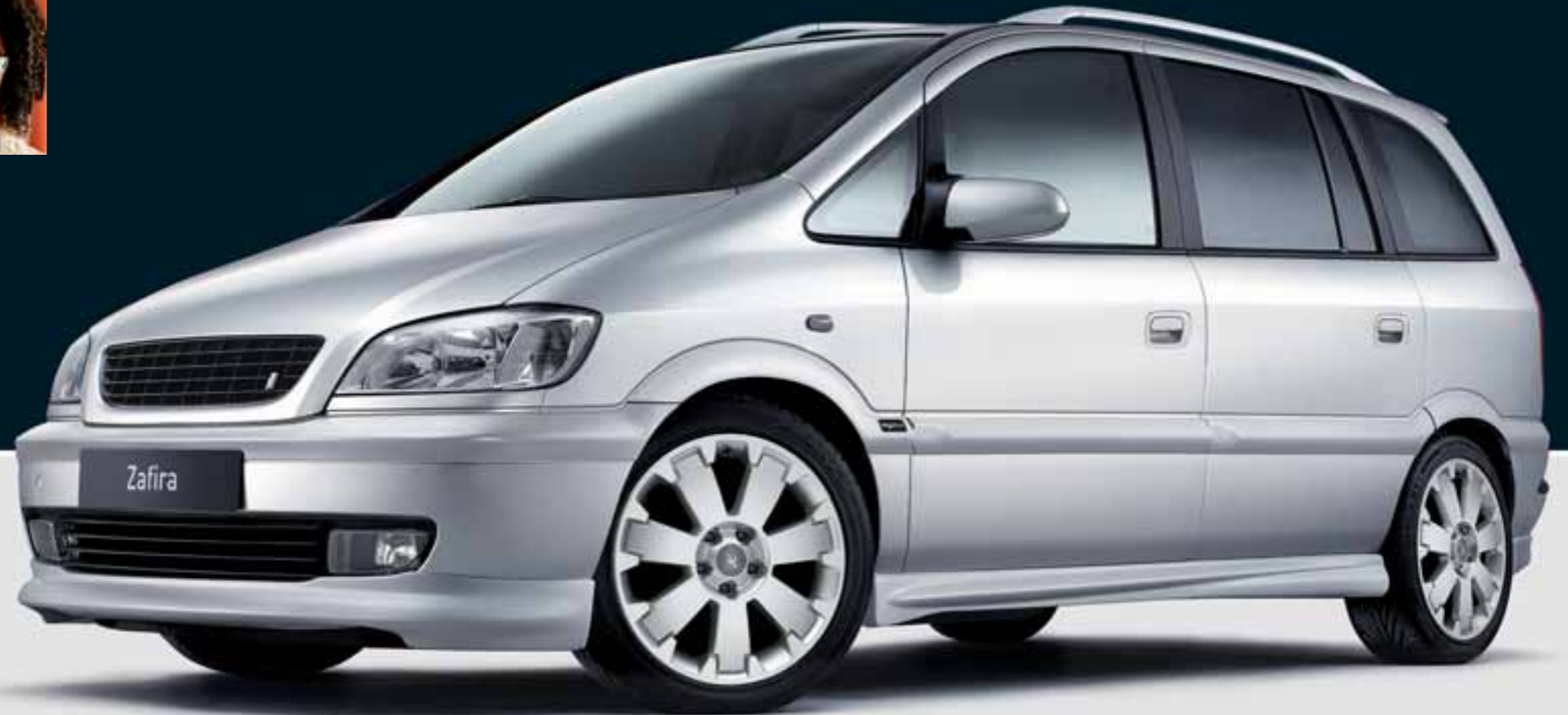
Model illustrated features Daytona pack, cross hatch grille with Irmscher 'i' logo badge, front lower spoiler, side sills, rear skirt extensions and rear roof spoiler.

You'll find further details about option and option pack availability and more information on the extensive range of Zafira accessories in the Specification insert. Alternatively, check out our website www.vauxhall.co.uk/accessories