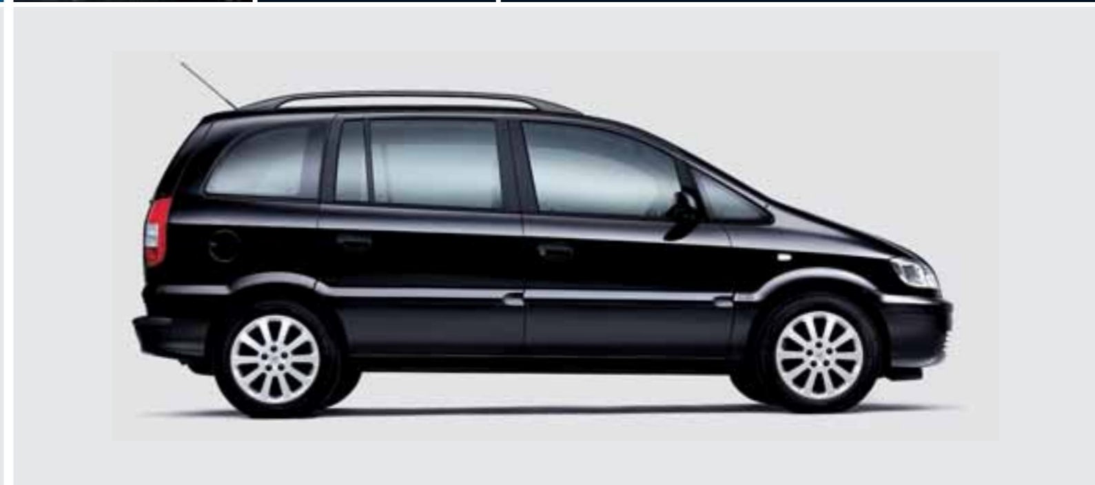
Multi-function swivelling armrest conceals handy drinks holders. Black Sapphire two-coat pearlescent paint is optional at extra cost.