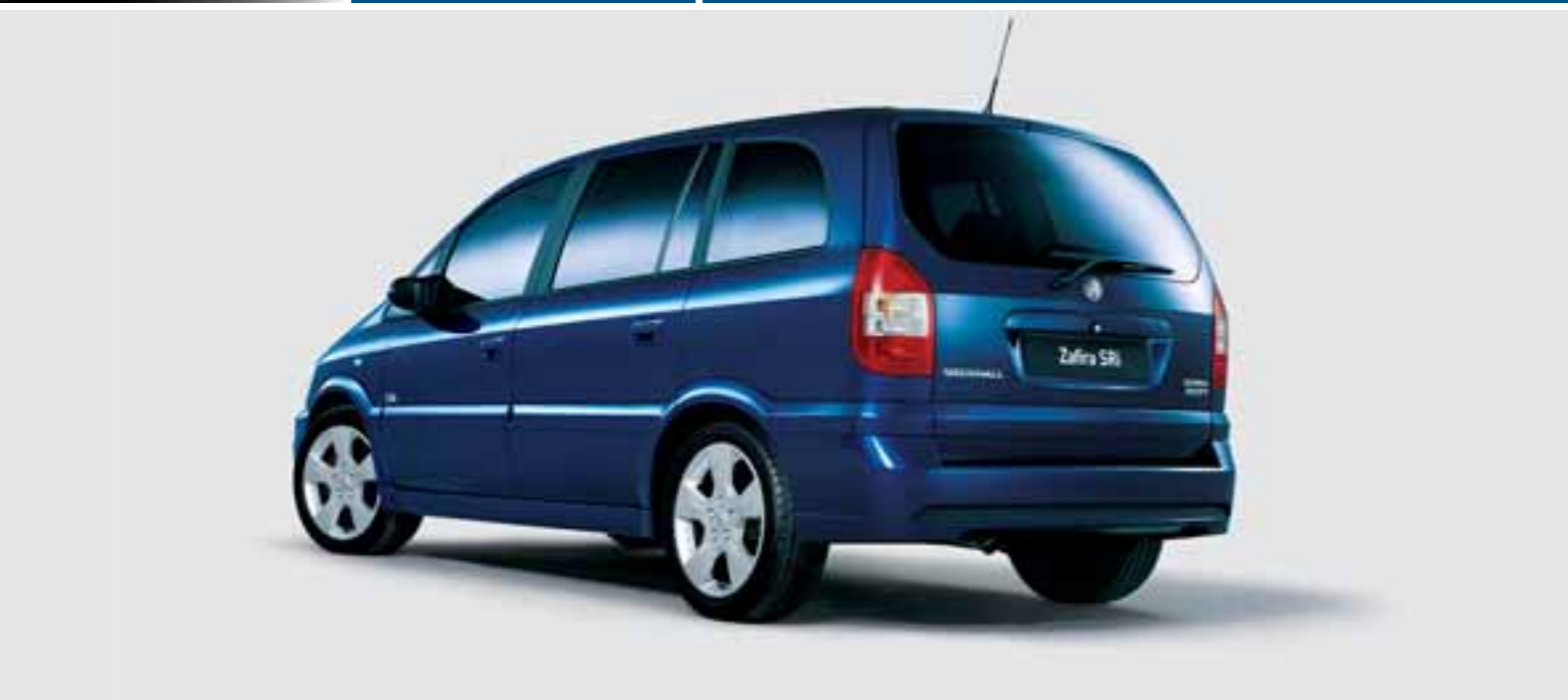
Leather pack is optional at extra cost. Ultra Blue two-coat pearlescent paint is optional at extra cost.