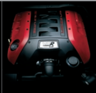
6.2 LITRE V8 ENGINE

▶ Fully adjustable coil-over dampers , developed by Walkinshaw Performance, can be tuned for customer preference and also allow you to adjust the height of the VXR8's ride for exceptional road holding and ride characteristics. The units also have 16 separate valve settings with independent corner adjustment for your preferred suspension set-up.