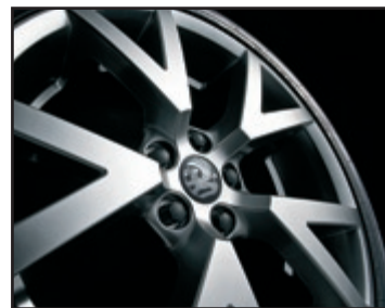
20-inch V-design alloy wheel.

Every effort has been made to ensure that the contents of this document were accurate and up-to-date at the time of publication (February 2009). Vauxhall vehicles are equipped with components manufactured by various General Motors operating units and outside suppliers. The Company reserves the right to alter specifications and withdraw products from sale without notice. Any such alterations will be notified to Vauxhall retailers at the earliest opportunity. please consult your local retailer for the latest information. The specifications detailed within this Special Edition document are not necessarily applicable to alternative VXR8 models. Details of any such models will be contained in specific literature or found on the Vauxhall website. Please note that Vauxhall retailers are not the agents of General Motors UK Limited and are not authorised to bind the Company by any specific or implied undertaking or representation. It is advisable to ensure that your motor insurance policy provides adequate cover for additional fitted options and accessories. All rights reserved. No part of this publication may be reproduced in any form or by any means, without the prior written permission of General Motors UK Limited.