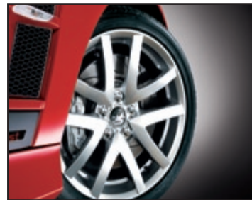
19-inch 10-spoke alloy wheel.

For more information on Walkinshaw Performance upgrades visit www.walkinshawperformance.co.uk