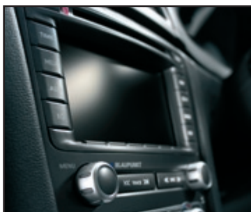
Optional satellite navigation system.