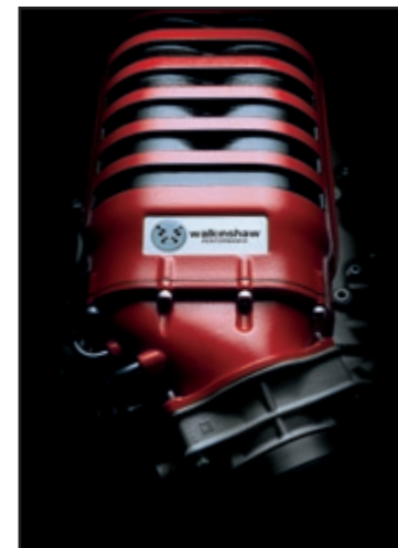
VXR8 Bathurst S supercharger.