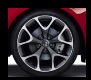
18-inch 5-Y-spoke bi-colour optional at extra cost