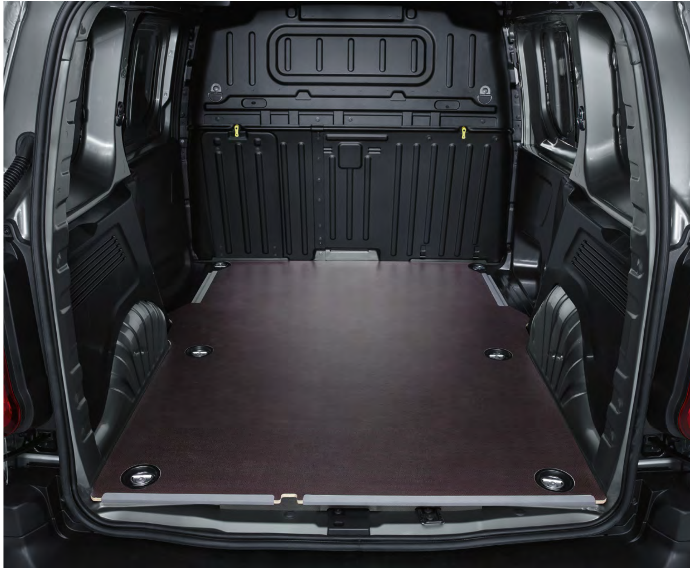
Full-height steel bulkhead.

Standard Features – The following features are standard across the entire Combo range.