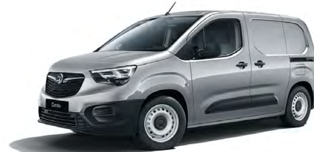
Quartz Silver (G41)** Two-coat metallic paint £475