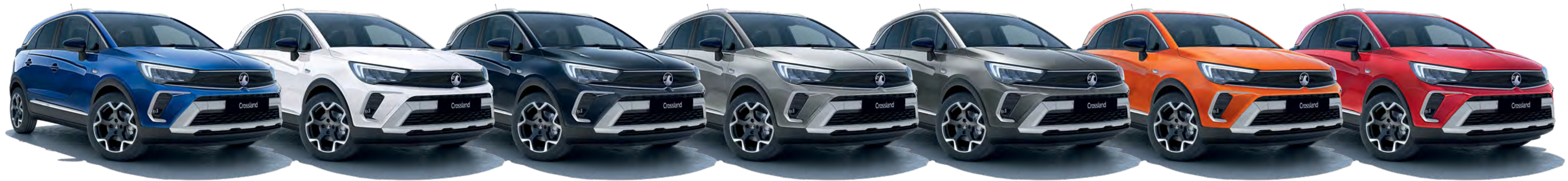
Navy Blue Two-coat metallic*