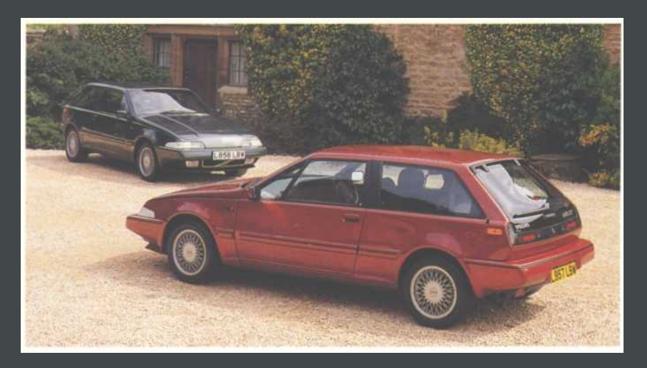
Photography on location at Weston Manor, Weston-on-the-Green.

The information, specification and illustrations relating to the models described in this brochure may be different in respect of similar vehicles currently on sale in the UK and the Republic of Ireland.