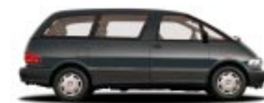
191 Midnight (m) Shadow Grey GL & GX only