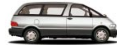
199 Lucerne Silver (m) Shadow Grey