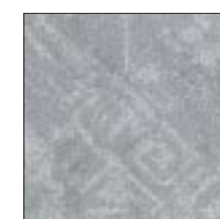
Shadow Grey GS & GL only