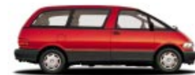
317 Henna Red (m) Shadow Grey 199