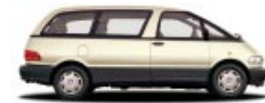
041 Ivory Shadow Grey