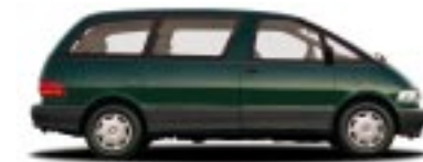
751 Galway Green (m) Shadow Grey