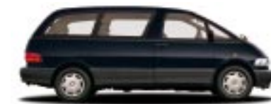
936 College Blue (m) Shadow Grey