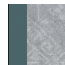
Shadow Grey GX only