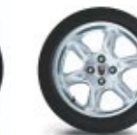
16" Cosmos with 205/45 R 16 radial ply tyres