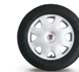
14" Wheel trim with 185/65 HR 14 radial ply tyres and full width wheel trims