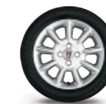
15" Fission with 195/55 HR 15 radial ply tyres