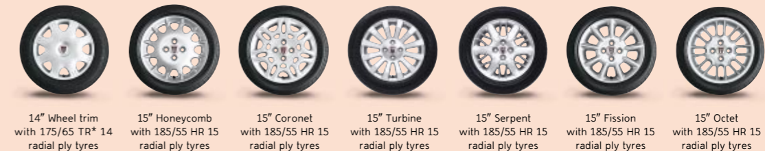
14" Wheel trim with 175/65 TR* 14 radial ply tyres 15" Honeycomb with 185/55 HR 15 radial ply tyres 15" Coronet with 185/55 HR 15 radial ply tyres 15" Turbine with 185/55 HR 15 radial ply tyres 15" Serpent with 185/55 HR 15 radial ply tyres 15" Fission with 185/55 HR 15 radial ply tyres 15" Octet with 185/55 HR 15 radial ply tyres