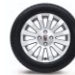
15" Turbine with 195/55 HR 15 radial ply tyres