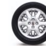
15" Serpent with 195/55 HR 15 radial ply tyres