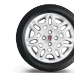
15" Coronet with 195/55 HR 15 radial ply tyres