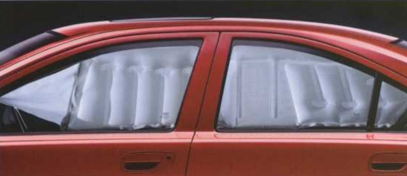
Volvo's unique SIPS side-impact protection system uses a large part of the car body to absorb the force of an impact. The IC (inflatable curtain) and side airbags provide maximum protection for the head and chest in a side impact.