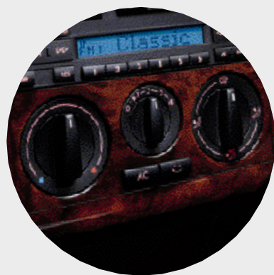
Manual air conditioning is standard on S, ST and SE models. The Sport, V5 and V6 4MOTION feature electronic climate control.