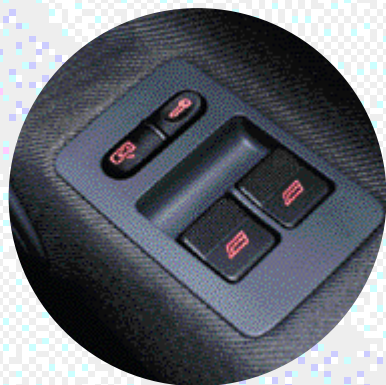
The convenience of front electric windows and central locking is optional on E and standard on all other models.