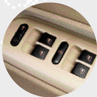
Front and rear electric windows are standard across the range.

The Bora impresses in many respects – its stylish design and outstanding quality; but when you consider the list of standard equipment, you'll also appreciate why the Bora represents superb value for money.