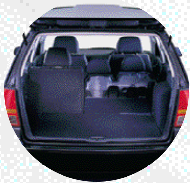
Split folding rear seats 60:40 provide greater flexibility. Standard on the Golf and Golf Estate.

The Golf is Europe's number one best-selling car – a position not attained through mere good fortune. Perhaps it's the build quality and legendary Volkswagen reliability that attracts customers? Or the high levels of safety with ESP (Electronic Stabilisation Programme), driver and front