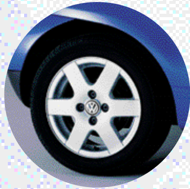
Stylish 'Kyalami' 14" alloy wheels are standard on Sport and optional on E and S models.

* Please see pages 22, 23, 24 and 25 for PS explanation, official fuel consumption and CO 2 emission figures.