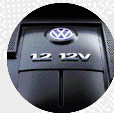
The new three cylinder petrol engines: Low weight means greater fuel economy.

The wide choice of trim levels and engines available in the Polo ensures that you can enjoy all the benefits of a small car without compromising on big car comforts.