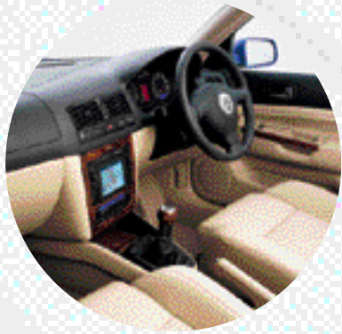
The interior of the V6 4MOTION with optional leather upholstery and navigation/radio system.