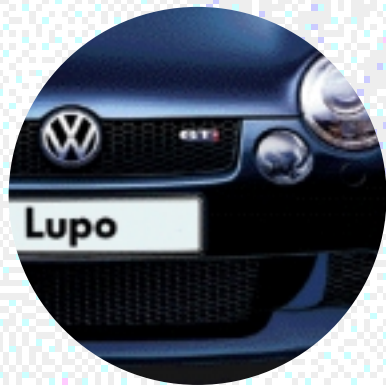
The mesh front grille enhances the sporty appearance of the GTI.