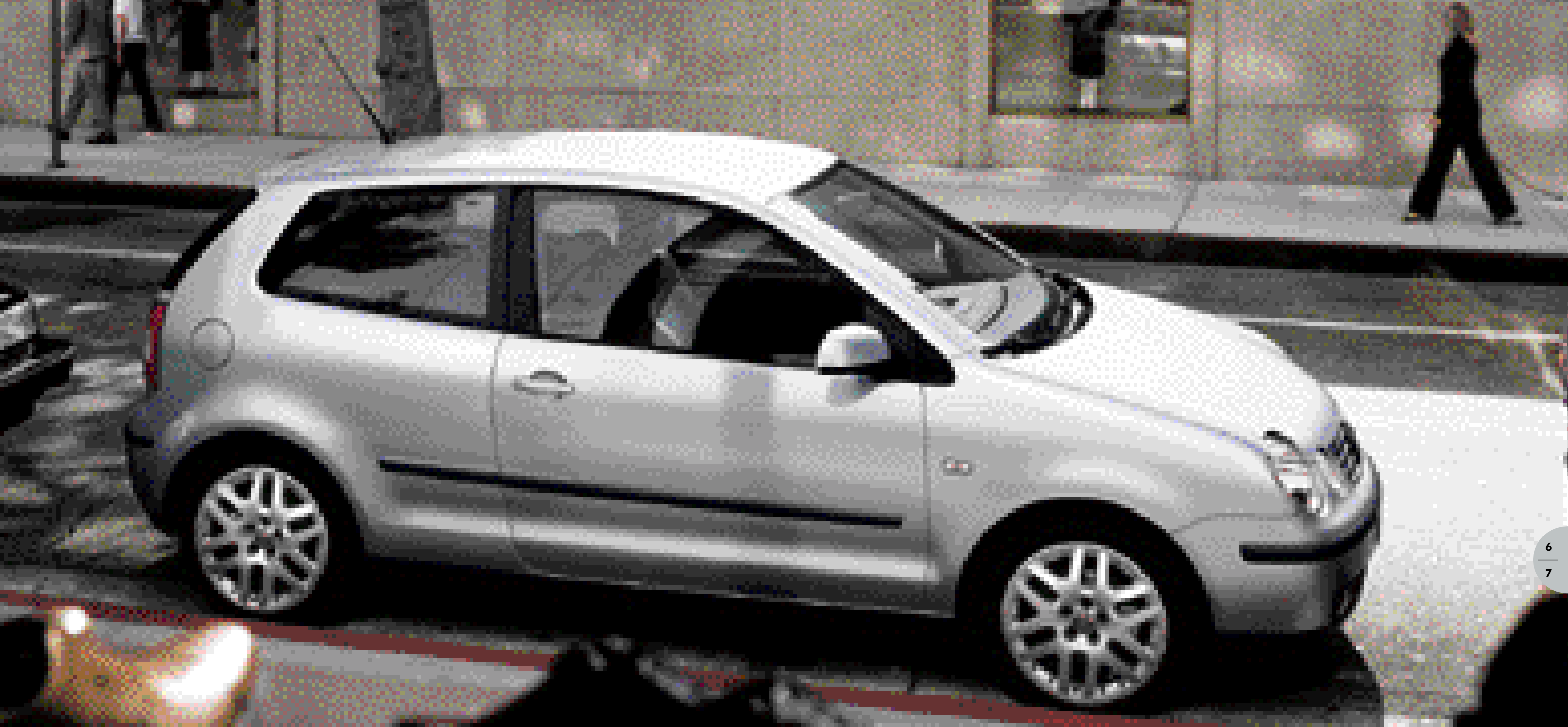
Model shown is Polo Sport fitted with optional 16" 'San Marino' alloy wheels.