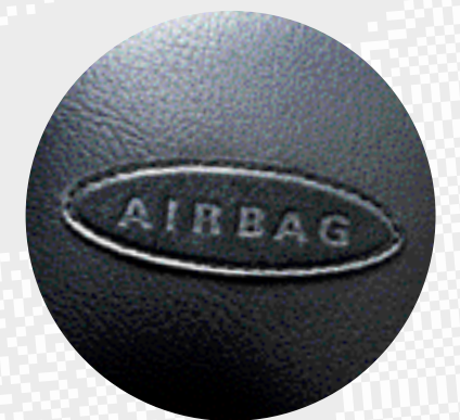
Front seat-mounted side airbags are standard on all models.