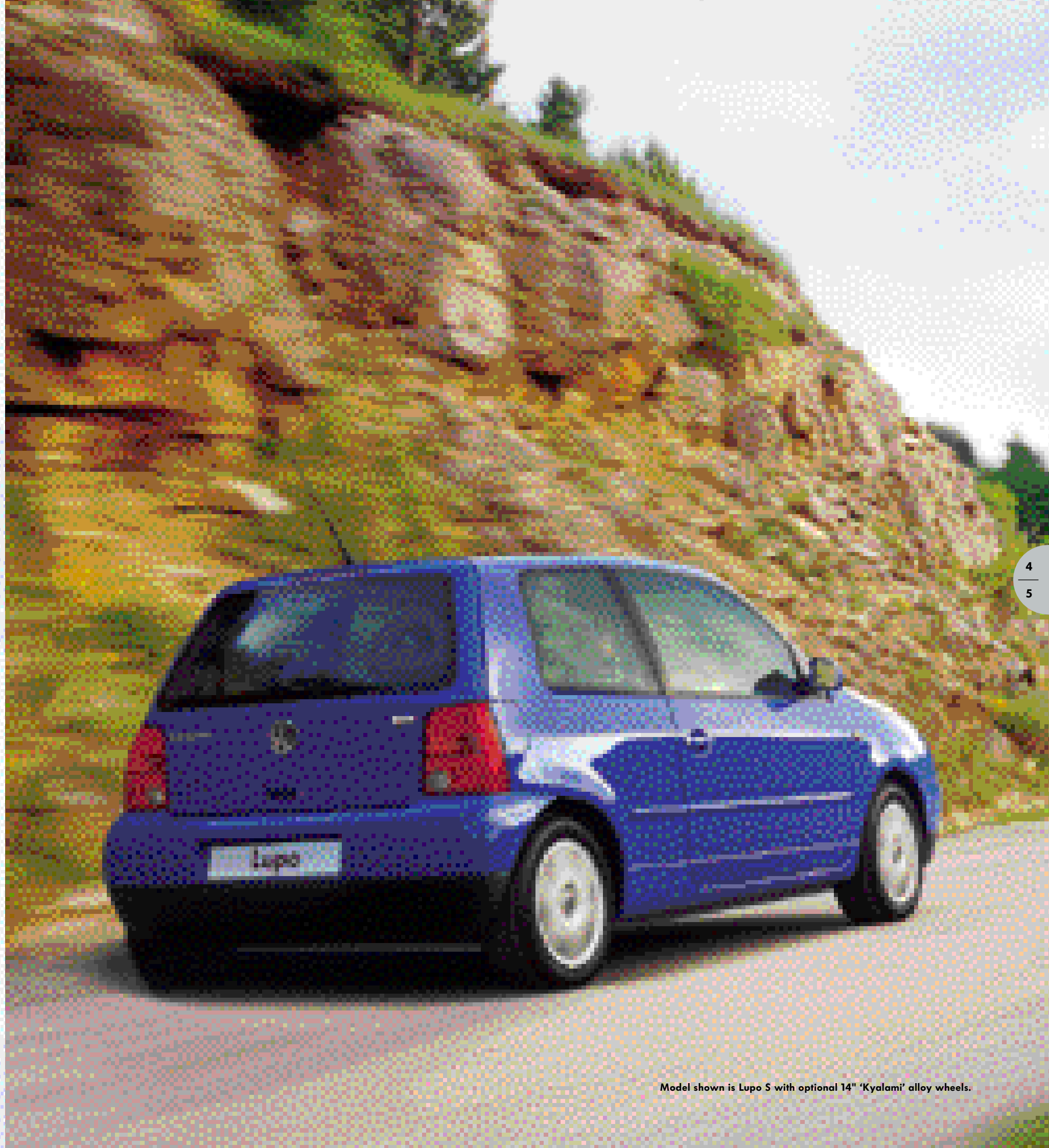
Model shown is Lupo S with optional 14" 'Kyalami' alloy wheels.