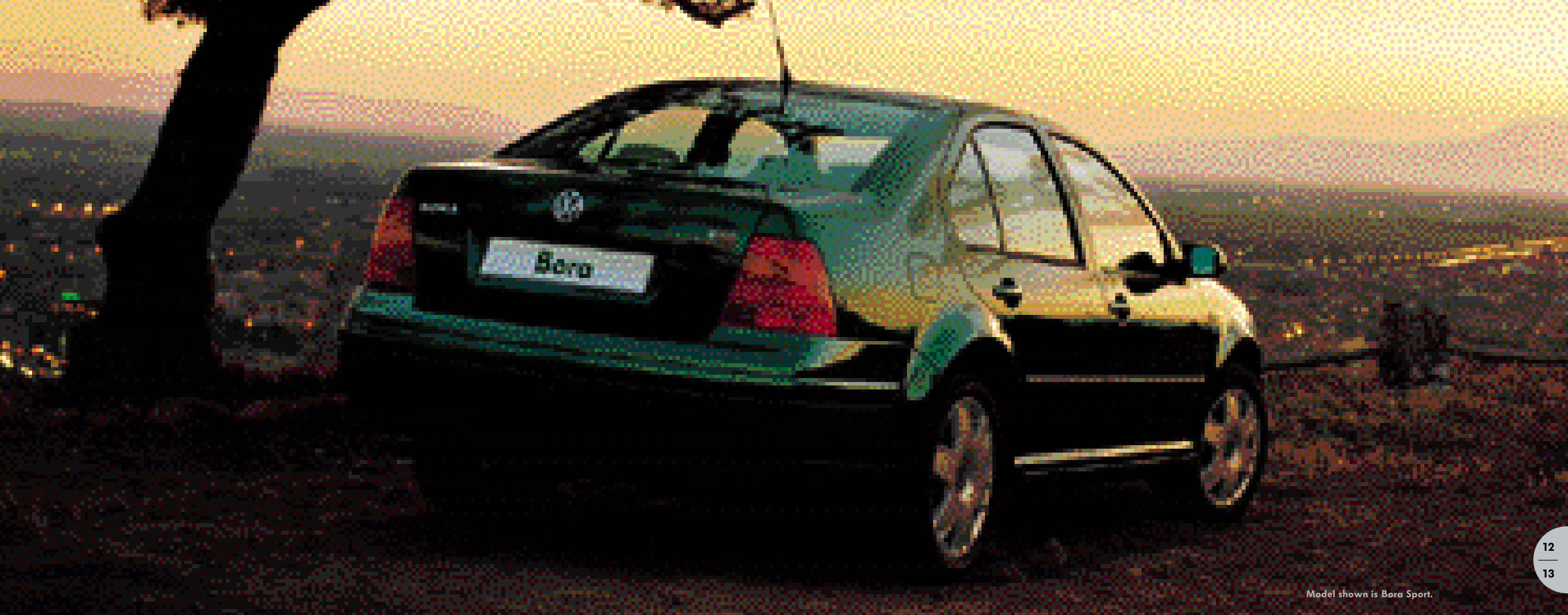
Model shown is Bora Sport.