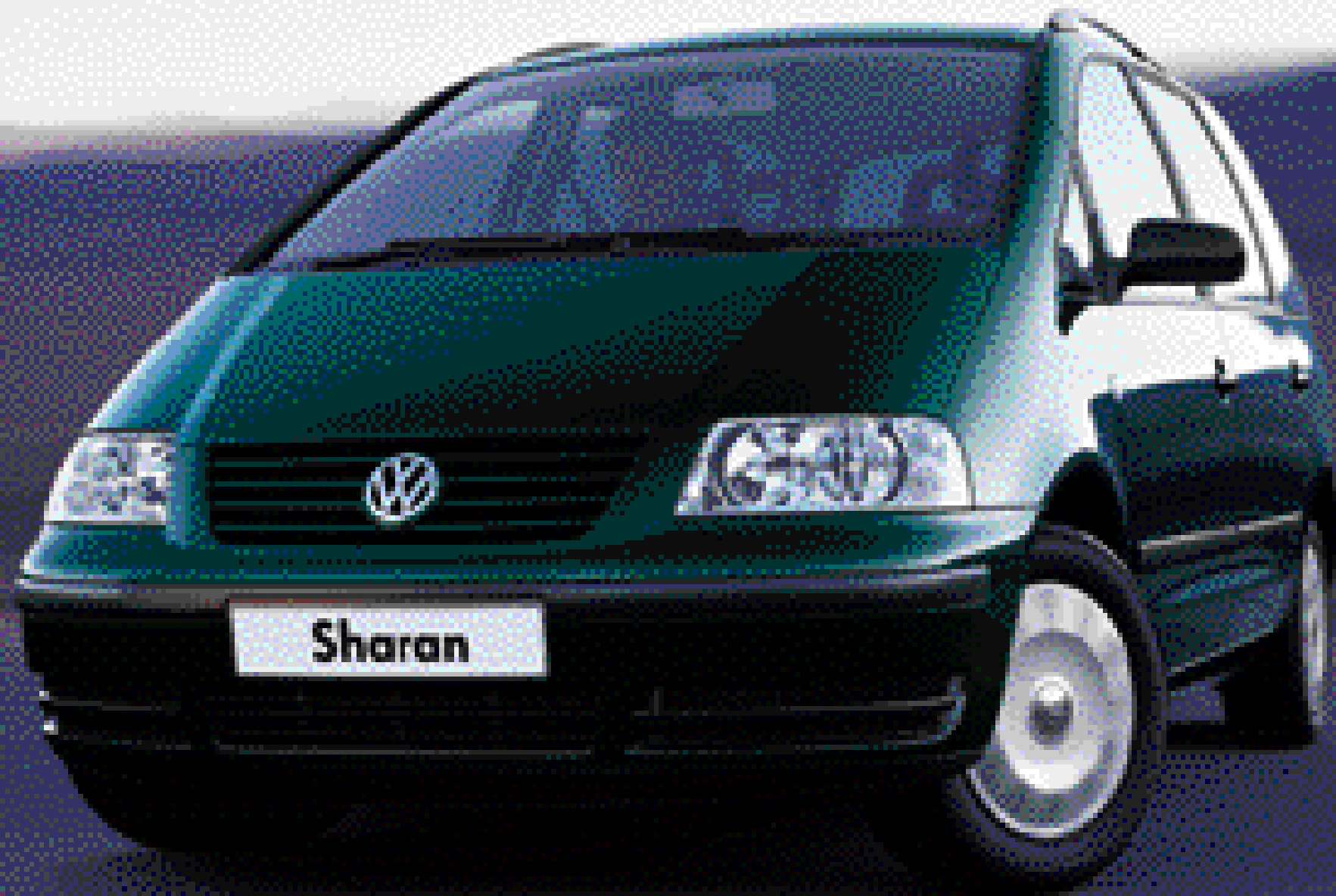
Model shown is Sharan SE.