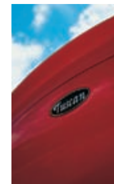
At home in Blackpool, the new Tuscan Convertible becomes the best entertainment on the promenade, particularly when you crank up its TVR-designed straight-six. The loss of the roof seems to suit the lines of the Tuscan well; TVR boss Nikolai Smolensky had considered a folding hard-top, but this was too complex and costly

Everything changes but stays the same. We’re standing on Blackpool seafront under a broily, admiring how the TVR’s curves contort the technicolour lights of the Golden Mile into swirling, galaxy-like patterns. It could be a dozen years ago, with the illuminations reflected in the body of a Griffith or Chimaera, but this is the new Tuscan Convertible, one of the first models to be launched under TVR’s new boss, the young Russian, Nikolai Smolensky.