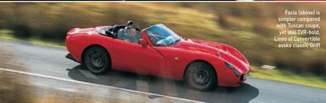
Facia [above] is simpler compared with Tuscan coupe, yet still TVR-bold. Lines of Convertible evoke classic Griff