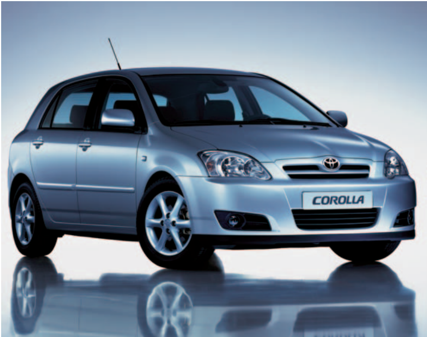
Vehicles shown are not to UK specification