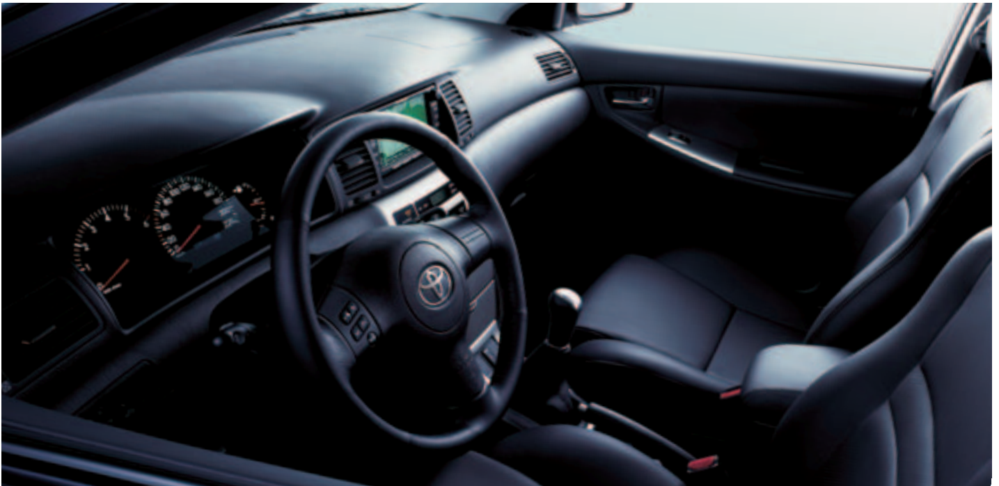
Vehicles shown are not to UK specification