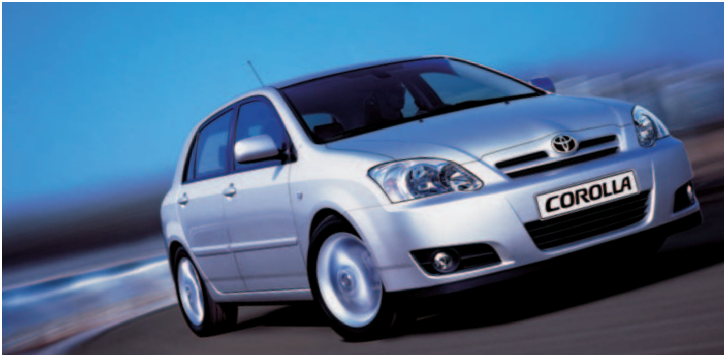
Vehicles shown are not to UK specification