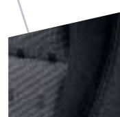
Minika Black cloth