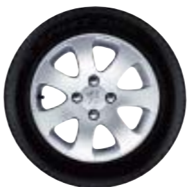
15" APOLLO (S 1.6 and HDi 90)