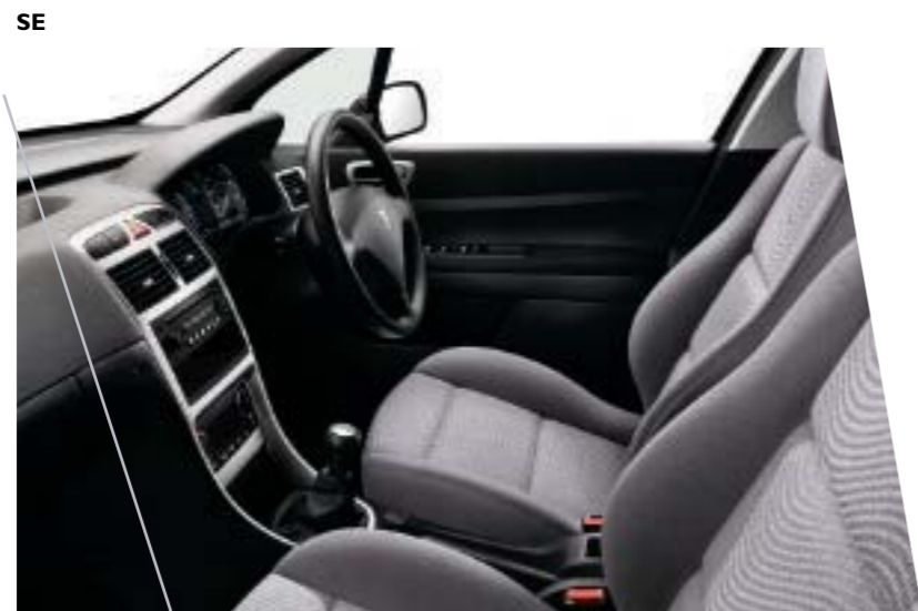
Agave Grey velour