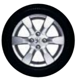
16" EQUINOX (S HDi 110 and SE)