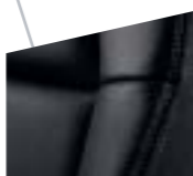
Astrakan Black leather*