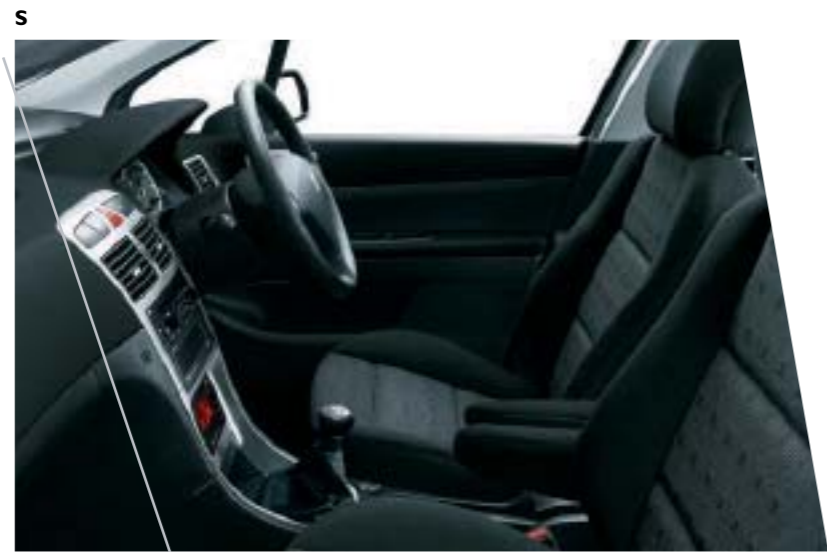
Minika Black cloth

The new 307 SW may have a look and personality all of its own. But to ensure that its character really complements yours, it comes with the choice of four interior trims, from elegant velour to refined leather. Giving you a vehicle that's custom-designed to be as individual as you are. And different from anything else on the road.