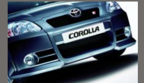
Optional front spoiler.